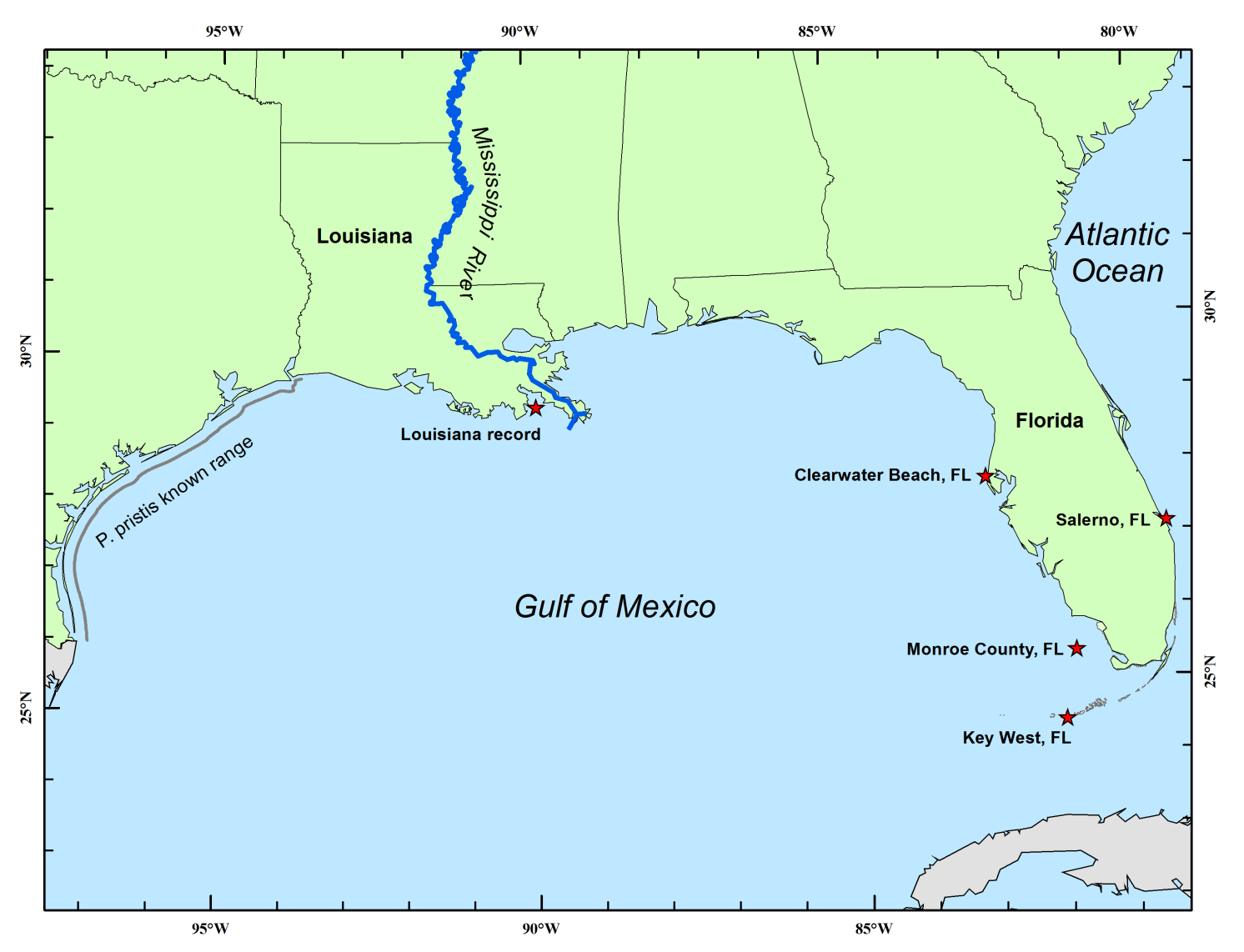
FIGURE 1. Map of Largetooth Sawfish records and specimens discussed in this paper. Location names on map refer to specimens purported from southern Florida (Monroe County), and elsewhere in Florida (Key West, Salerno, and Clearwater Beach). One specimen was purported from Louisiana.

(e.g., primary and secondary literature, unpublished reports, unpublished data) for evidence to corroborate or repudiate the stated localities of these specimens.