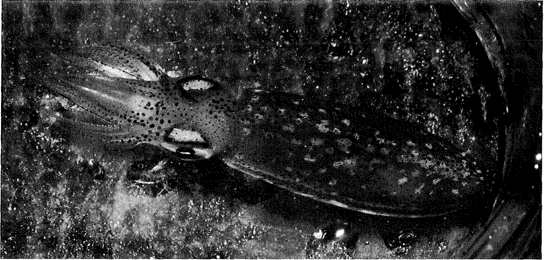
Fig. 2. Loligo roperi : live female (45 mm DML) showing chromatophore patterns. The animal was captured approximately 0.2 m above a coral head on 10 Sep. 2001; photographed shipboard in a glass specimen dish.

pealeii and L. plei ) may have previously occurred.