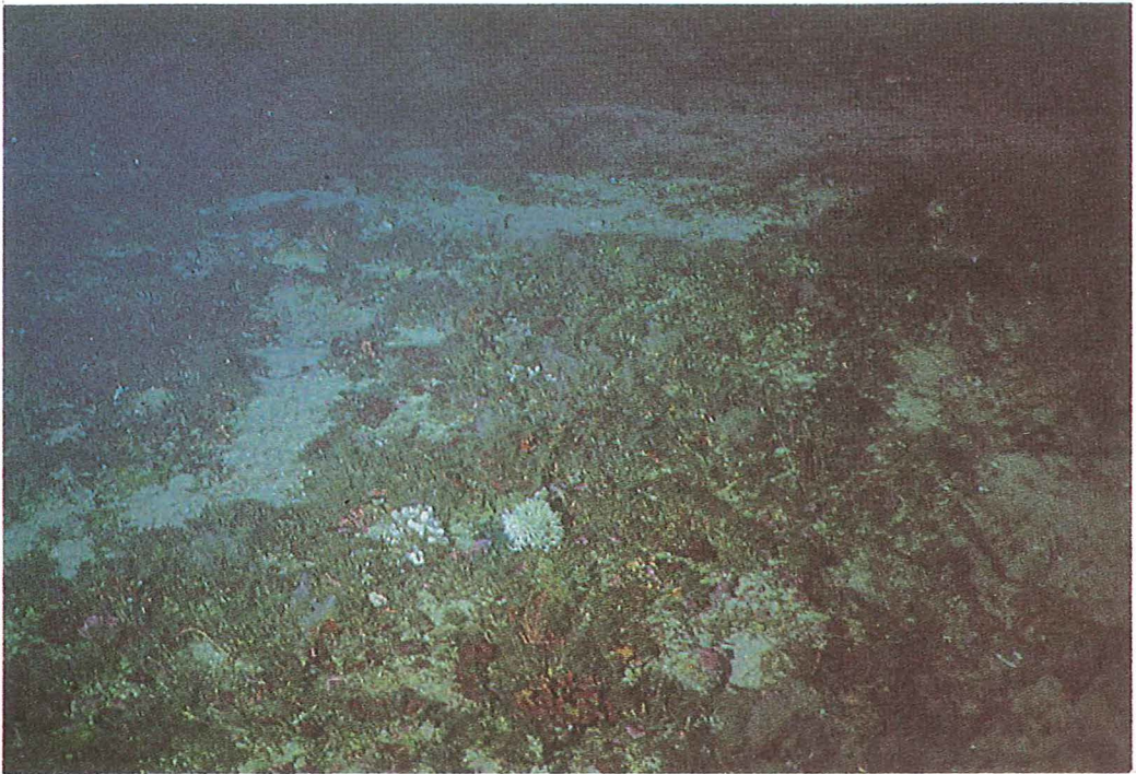
Figure 2. A hard-bottom area at 50-60 m depth in James Island Area Block 463 (center of block at 32°29'58"N, 78°49'43"W) colonized by a dense mat of the polychaete Phyllochaetopterus socialis and associated organisms.