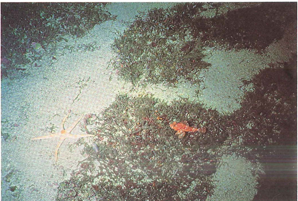
Figure 3. Patches of the polychaete Phyllochaetopterus socialis in James Island Area Block 463. Note the coarse sand surrounding the mats and interspersed throughout the tube matrix. Also visible are the red alga Peyssonnelia rubra , the asteroid Narcissia trigonaria , and the scorpionfish Scorpaena sp.