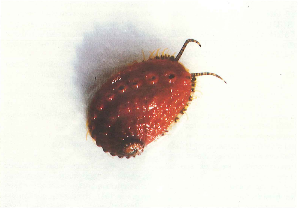
Figure 1. Dorsal view of Haliotis pourtalesii Dall, 1881.