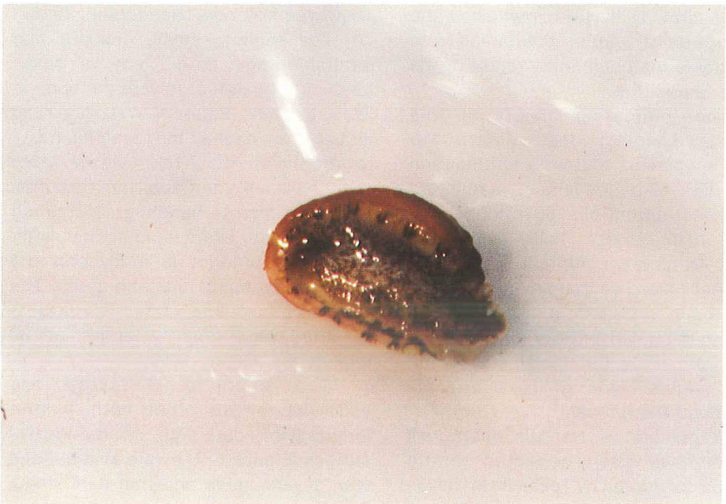
Figure 2. Ventral view of Haliotis pourtalesii Dall, 1881. Note that foot is folded medially.