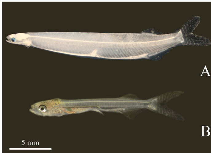
FIGURE 2. Photographs of Atlantic Tarpon Megalops atlanticus leptocephali examined in this study. A. Deceased specimen (Stage 2, Phase VII, 20.8 mm SL) collected in September 2016 from Bellefontaine Beach. B. Deceased Leptocephalus #2 (Stage 2, Phase IX, 15 mm SL) 38 days post-capture.

GOM's contribution to adult populations. The northernmost range of Atlantic Tarpon is limited mainly by temperature, and juveniles succumb to ambient water temperatures