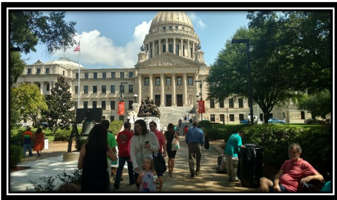
Mississippi Book Festival, Jackson

For lovers of books, August 19 th was a day to remember. The Mississippi Book Festival, an annual event in Jackson, attracted over eight-thousand this year. In addition to the usual presentations and panels by southern authors, editors, and illustrators, this year's Festival offered outdoor activities for all ages, children to seniors, as well as appearances and readings from noted authors and other celebrities.