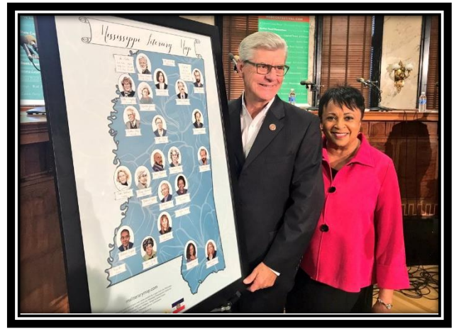
Governor Phil Bryant and Dr. Carla Hayden Unveiling Mississippi Literary Map*

Dr. Hayden visited the Mississippi Library Commission and was present for the 2017 Festival's kick-off event, the unveiling of the updated Mississippi Literary Map, with state Governor Phil Bryant in attendance.