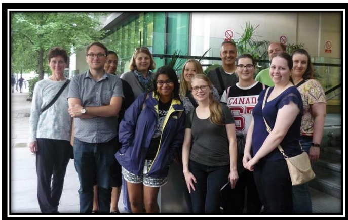
British Studies Class of 2017 University of Westminster Marylebone Hall