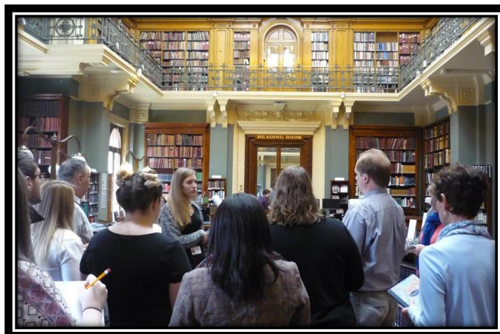
National Art Library V&A Museum, London

Twelve LIS graduate students, or post-graduates as they are known in the U.K., earned six credit hours of study-abroad credit in USM British Studies. The 2017 class was a diverse group of scholars from six universities: San Jose State University, Simmons College, University of Alabama, University of North Carolina, Greensboro, University of South Carolina, and The University of Southern Mississippi.