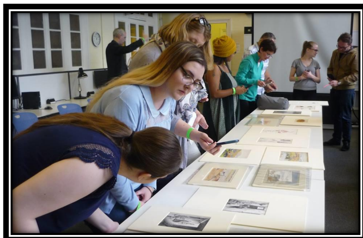
Beatrix Potter Archive Blythe House, London

Students accompanied faculty to sites such as Oxford, Stratford-upon-Avon, and Bletchley Park - and had time to explore sites of interest on their own. Students and faculty were headquartered at University of Westminster Marylebone Hall in London, a five-minute walk from Regent's Park. In addition to participating in lectures and behind-the-scene tours, students are required to submit book reviews, a reflective journal/blog, and research paper on an approved topic.