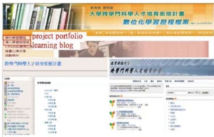
Figure 1. Homepage of the e-portfolio system.

The “learning blog” function highlighted in Figure 1 was the space for students to show their reflection, their learning activities records, learning diaries, and so on. It is also a place for social interaction. Figure 2 shows the homepage of the learning blogs. There are three main lists in this page: the latest posts, the most active blogs, and the latest created blogs. The most active blogs were ordered by the number of comments replied.