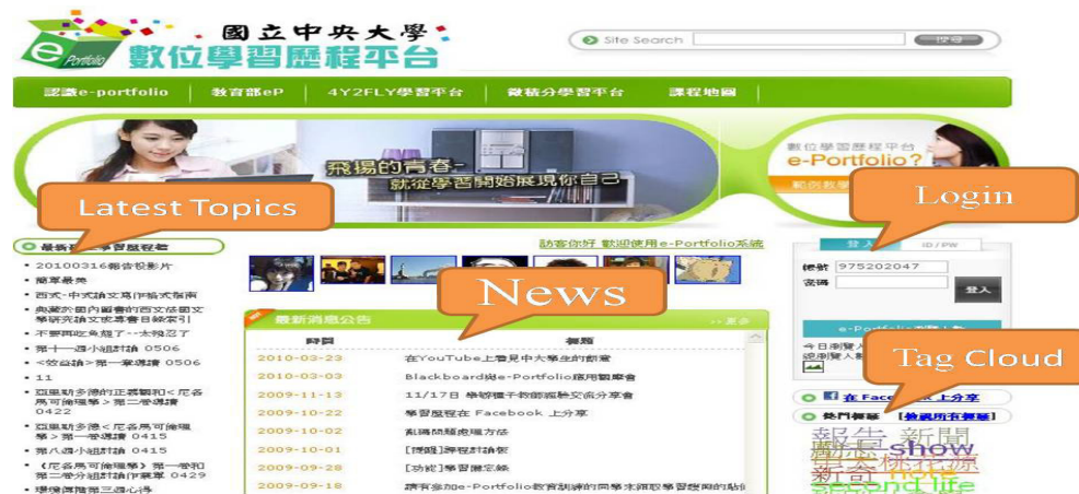
Figure 2. E-Portfolio homepage.