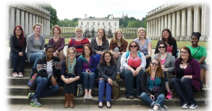
British Studies LIS Class of 2013, Greenwich, UK

An extra treat for students this summer is "Comics Unmasked" British Library exhibit of mainstream and underground comics such as those by Neil Gaiman, Alan Moore, Grant Morrison, and Posy Simmonds. http://www.bl.uk/whatson/exhibitions/