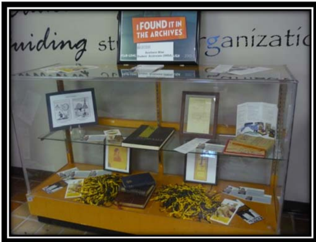
National Archives Month Display, October 2014

October was National Archives Month and to celebrate, SMSA officers created a display of archival materials in the Southern Miss Student Union.