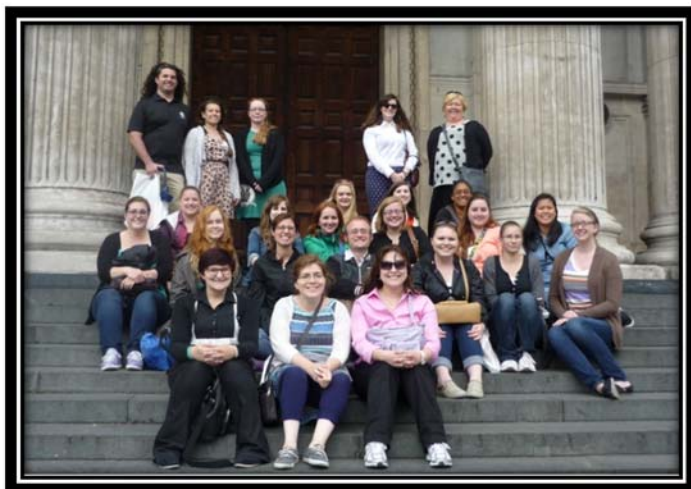
British Studies LIS 2014 Class on Steps of St. Paul's Cathedral, London, U.K.