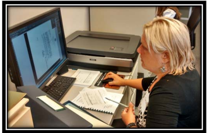
2014 Digi Day