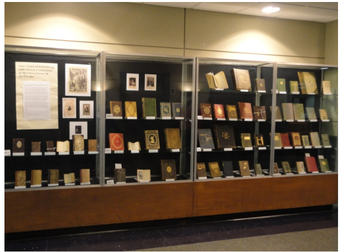
100 Years of Publishing: 19 th Century Literature at McCain Library and Archives

Bindings were recorded as being original or rebound. Binding colors were also documented as well as the presence of pages with gold edges or "all edges gilt" which is a term used to describe a book having page edges that are gold (Antiquated Booksellers' Association of America, 2012). Binding materials were also determined as being leather, cloth, or paper.