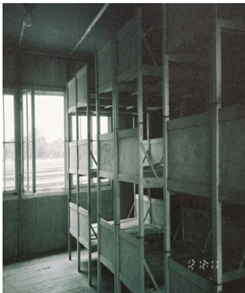
Photograph 6: Sleeping area within Dachau Concentration Camp.