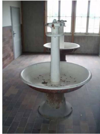
Photograph 5: Washing area inside Dachau Concentration Camp.