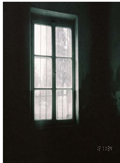
Photograph 7: Window inside cell Dachau concentration camp.