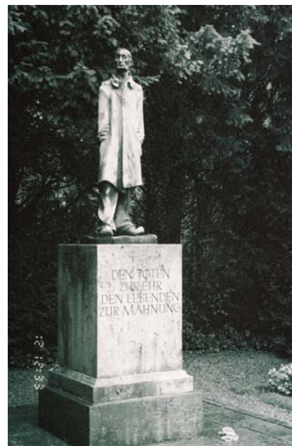
Photograph 7: Statue at Dachau concentration camp