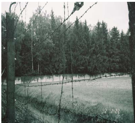
Photograph 6: Barbed-wire fence surrounding Dachau concentration camp