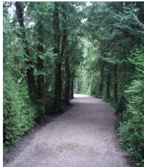
Photograph 13: Path to "blood ditch" at Dachau concentration camp