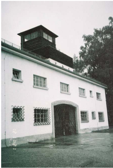
Photograph 1: Dachau Entrance

Dachau concentration camp, outside of Munich, Germany, allows a glance into the past. At the camp, research was carried out on prisoners; and research can go terribly wrong when research subjects are not protected. Egos of scientists and others in power can cause disastrous results. That is what happened at the Dachau concentration camp.