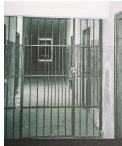
Photograph 2: Prison Gate in Dachau Concentration Camp

guards. The washing and toilet areas are a reminder of the prison conditions. There are no walls or curtains separating the toilets or large sinks. Prisoners were forced to sleep in