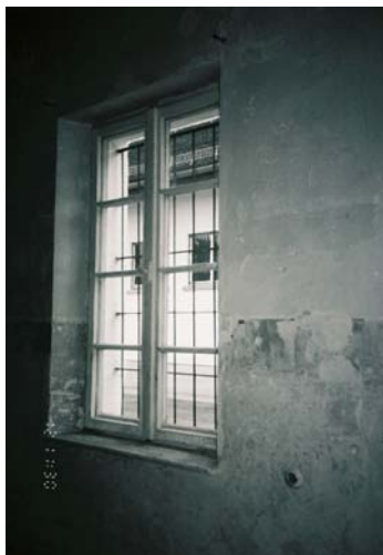
Photograph 3: Cell Wall in Dachau Concentration Camp

As visitors walk the grounds of the camp, the damp cold envelopes them. The main camp is at the right, while rows and rows of blank spaces, neatly lined, blanketed the ground to the left—ghosts of the barracks that once stood on the ground. At the far end of the camp are memorial buildings, much like churches, and then a path that leads to the crematoriums, gas chamber, and the woods that hid the blood ditch and the ashes of prisoners.