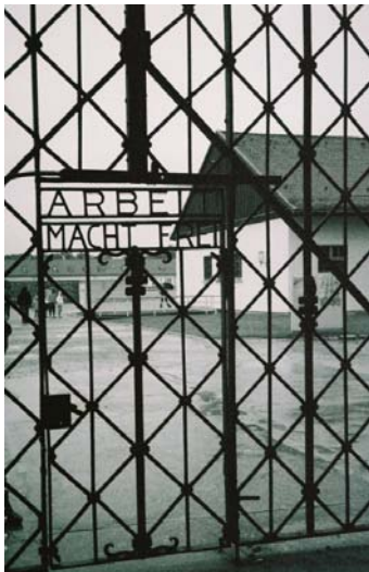
Photograph 16: Gate at entrance to Dachau concentration camp.

Editorial Note: The opinions expressed by authors represent those of the authors and do not reflect the opinions of the editorial staff of The Online Journal of Health Ethics.