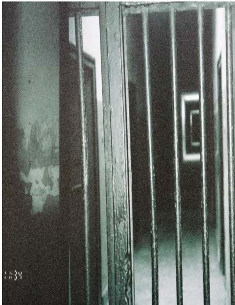
Photograph 8: Inside prison cell in Dachau Concentration Camp.