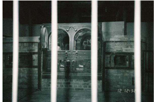
Photograph 14 and 15: Crematorium ovens inside Dachau concentration camp