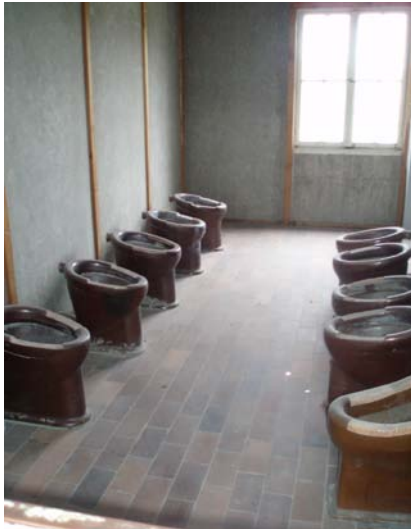
Photograph 4: Bathroom area within Dachau concentration camp