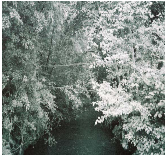
Photograph 5: Area surrounding Dachau concentration camp