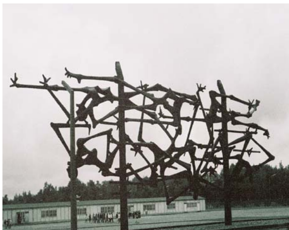
Photograph 12: Art sculpture at Dachau concentration camp

The gate closes as visitors exit, and the metal clasp clinks shut. It is hopeful that the pain remains there and does not transfer anywhere else. And for a brief moment, visitors may picture men with protruding bones in striped heavy clothing, slumped over, chained at the legs, walking down the dusty lane toward the edge of the camp where the crematoriums lay hidden. And just when visiting intruders catch their breath, the vision appears of prisoners turning their heads ever so gently to look with their hollow eyes at the gate. There would be no freedom for many of them until their last breath.