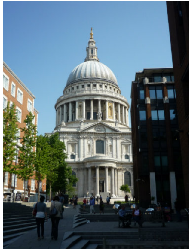
Modern View of St. Paul's Cathedral

Valencia, M. (2002). Libraries, nationalism, and armed conflict in the Twentieth Century. Libri , 52(1), 1-15.