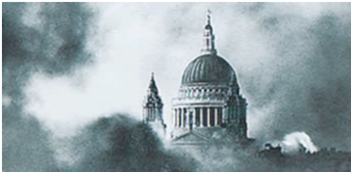
Figure 1. St. Paul's Cathedral after bombing of Dec. 1940

Cultural attacks, especially attacks on books, have been common place during conflict throughout history (Stubbings, 1993). Libraries in particular have been targeted since books and libraries are symbols of cultures (Valencia, 2002). Nazi Germany was not an exception to attacks on culture before and during World War II (Figure 1). A total war had begun under the Nazis which meant that no area of society was exempt from attack (Valencia, 2002).