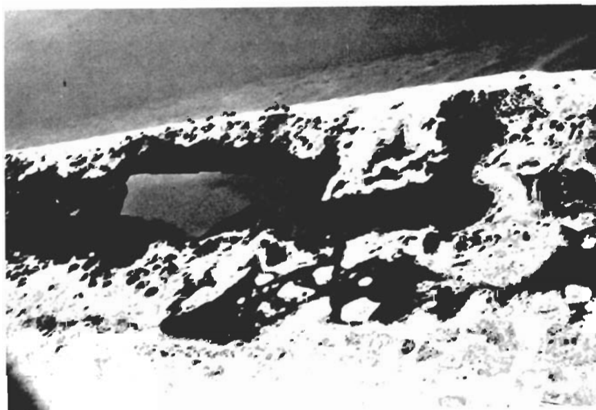
Figure 6 An aerial view of station 33, a landlocked lagoon near the center of the island. Tall pine trees line the Sound beach (uppermost).