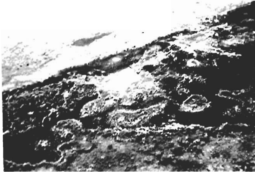
Figure 7. An aerial view of the "potholes" (station 1a, 1b, 1c, and 1d from left to right). A portion of the Gulf beach is shown uppermost.