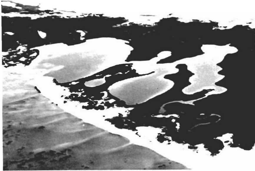
Figure 3. An aerial view of station 10, the tidal lagoon which is permanently connected with Mississippi Sound (in foreground). The Gulf of Mexico is shown uppermost.