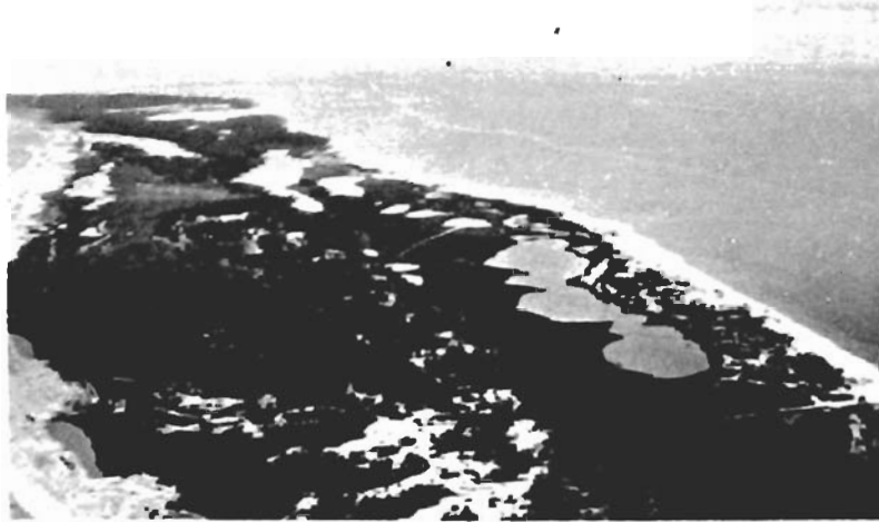
Figure 4. An aerial view of a section of the island (westward direction). Mississippi Sound is to the right and the Gulf of Mexico is to the left. Station 23, a tidal lagoon, is shown in the lower right.