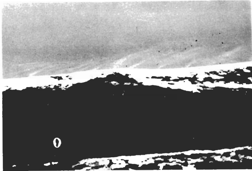
Figure 8. An aerial view of station 3, a ditch which is open to Mississippi Sound during high tide.