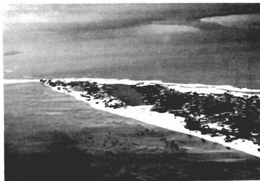
Figure 5 An aerial view of Station 38, a landlocked lagoon which is located on the east end of the island. Mississippi Sound is shown in the foreground, and the Gulf of Mexico and Petit Bois Island lie in the background.