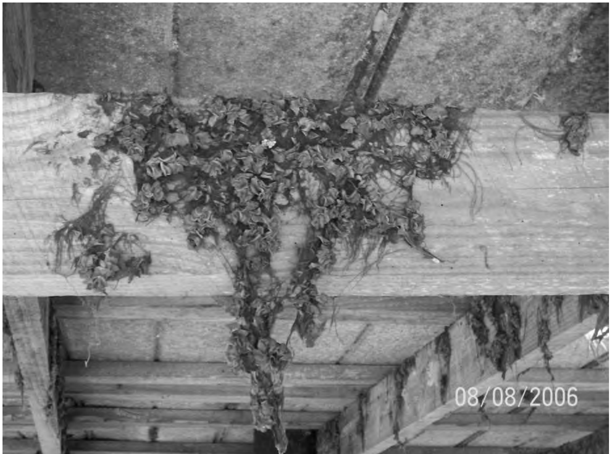
Figure 2. Giant salvinia draped on rafters of a boat house along the Pascagoula River in the study area nearly a year after Hurricane Katrina.

Mississippi Department of Marine Resources will continue conducting monthly boat and quarterly aerial surveys to look for new infestations and will survey the affected areas every 2 weeks. They will also continue public outreach efforts such as signs at boat ramps and brochures at fishing camps,