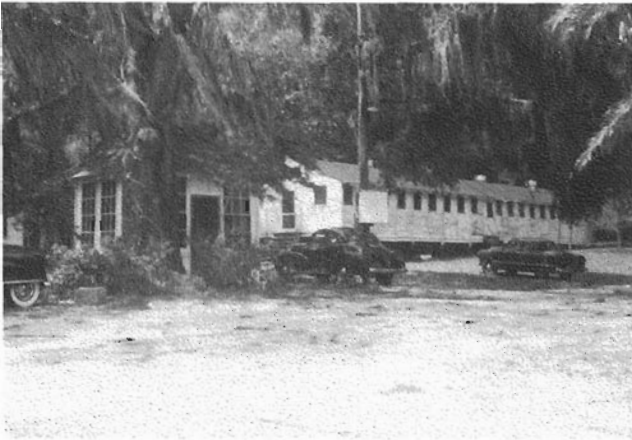
The small building to the left of the old dining hall was an aviary, one of the original existing buildings at the time the state purchased the present laboratory site. The building, used for a greenhouse by the first botanist on staff, was swept away by Hurricane Camille. The dining hall was torn down in 1996.