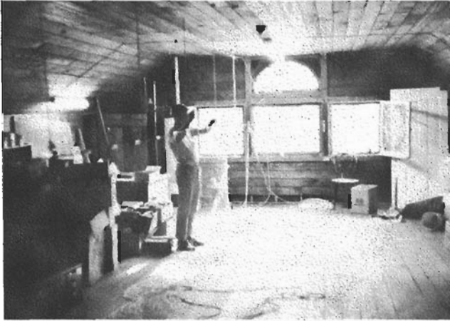
The attic of the "Big House" was reserved for staff members to create and repair the nets needed for sampling the waters of the Gulf of Mexico and Mississippi Sound.