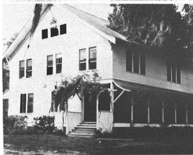
The "Big House"—One of the original structures of the GCRL property.

GCRL advanced another step on February 11, 1949, when the IHL established the research laboratory as "a separate and independent institution of higher education and research in Mississippi to be operated by the Mississippi Academy of Sciences." Soon after that IHL action, negotiations turned serious for purchase of the present location, property just across the bayou from Magnolia Park that had recently become available. Bailey's history describes this property as the former estate of D.A. Smart, who at one time was an editor of Esquire magazine. Under consideration was the 39-acre site that included a large two-story house — affectionately