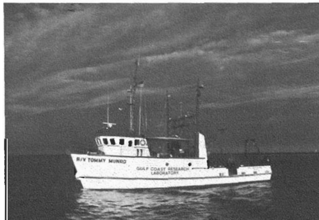
GCRL's 97-foot oceanographic vessel, the R/V Tommy Munro