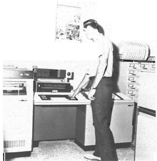
Computer Power — The old GCRL computer occupied an entire room in the late 1960's