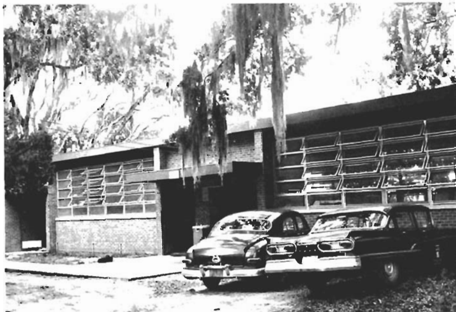
Figure 4. The old, un-air-conditioned Hopkins Building before Hurricane Camille.

Physical facilities were slowly improving. Since its completion in June 1951, the geology classes were able to utilize parts of the small (30 by 60 feet) Caylor Building, the first brick structure on the campus. After the arrival of Dr. Gordon Gunter in 1955 to be director of the Laboratory, a second one-story classroom-laboratory building, named after A. E. Hopkins, was opened in 1956 and all of the Caylor Building along with parts of the Hopkins Building were used for geological purposes. Both these structures and the “Big House” were demolished in the 1969 hurricane and only the Hopkins Building was rebuilt thereafter. By this time, however, geology work had for several years been occupying modern, well-equipped, air-conditioned