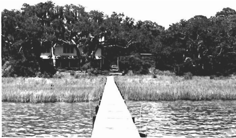
Figure 1. The “Big House” shrouded by live oaks, from the pier. The building was demolished by the 1969 hurricane and a parking lot covers its site.

peninsula at 15–18 feet elevation and provided the potential for the further expansion of the Laboratory.