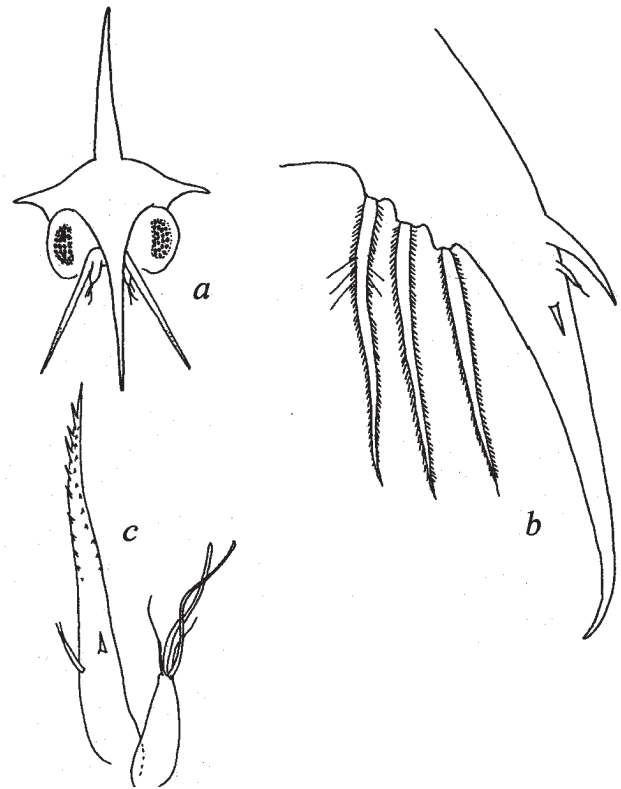
Figure 3. Additional figures of the first zoea of Platypodiella spectabilis from a female collected in the British Virgin Islands. a, frontal view showing relative lengths of lateral and dorsal carapace spines. b, right fork of telson and right side setae, dorsal view. c, antenna (left) and antennule (right).

Second Maxilliped (Figure 2e). Coxa without setae. Basial segment with 4 medial plumose setae arranged 1, 1, 1, 1. Endopod 3-segmented, with 1, 1, and 2 subterminal + 3 terminal plumose setae. Exopod 2-segmented, with 4 terminal plumose setae.