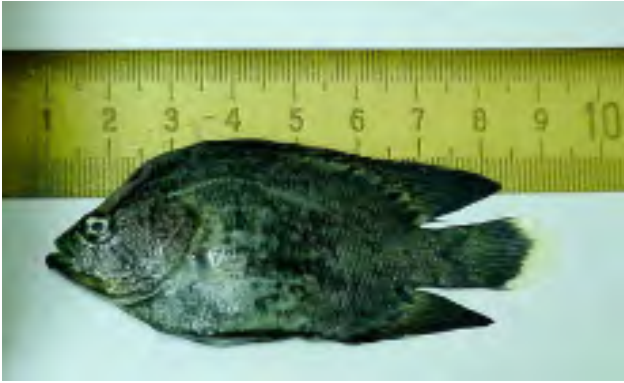
Figure 1. Photograph of a small (82 mm TL) juvenile tripletail Lobotes surinamensis used in the growth study.

25.2° to 29.0° C and salinity was maintained at 28.0‰. Juveniles were reared for 210 days and all specimens survived until the end of the experiment.