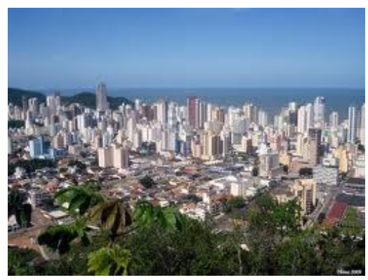
Figure 3. Balneário Camboriu, 2010

The city continued to be consolidated as attractive, and in the last decade has suffer many changes that revitalized the tourism demand in your territory. Leisure facilities were implanted in the road that connects it with other coastal municipalities of Santa Catarina, and the city has promoted the strengthening of tourism for the elderly, which guarantees the occupancy of hotels and lodges outside the summer season. In high season the attractions are aimed at urban youth, with many leisure facilities addressed to this age.