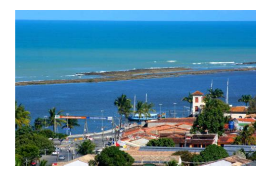
Figure 4. Porto Seguro, 2010.

Porto Seguro guard as major tourist attractions, the fact of having been the site of entry of the Portuguese in Brazil, and also the existence of natural ecosystems with scenic beauty. It was recognized as a 'place of origin of the Brazilian nation" and was considered a National Historic Landmark by the National Institute of Historical and Artistic Heritage (IPHAN).