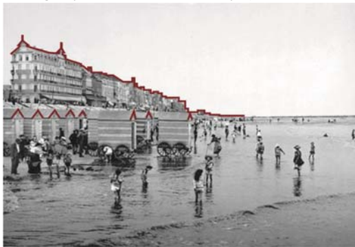
Figure 1. Bathing machines

Tourism began as an urban phenomenon. An invention that crystallizes the values and the social practices even in areas that are distant from the urban model, based on attributes established for the city: mass, contiguity and monumentality (Cooffé, 2010).