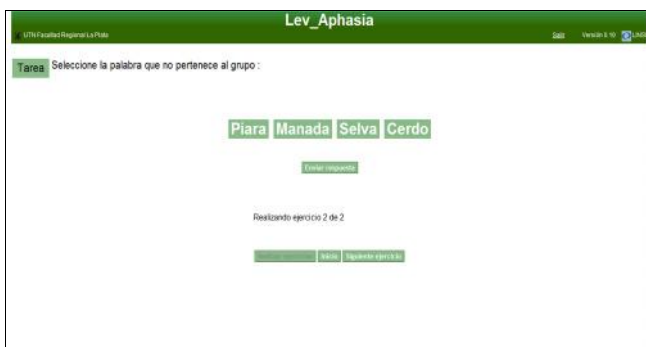
Fig. 6, LEV_APHASIA patient interface (example).

As you can see in the figures 5 and 6, the interface is very user-friendly.