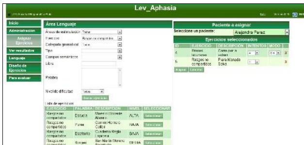
Fig. 5. LEV_APHASIA therapist interface (example).

Up to now, LEV-APHASIA has been tested in the laboratory with very few cases but it has proved to work in full capacity.