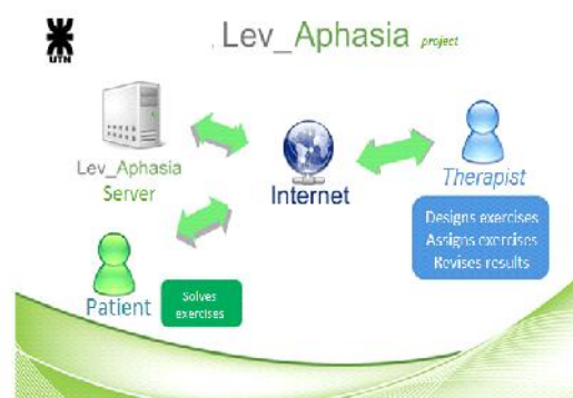
Figure 2. LEV_APHASIA system lay-out.

The project has different goals and aims, but the most important is the possibility of interaction between patient, therapist and web exercises.