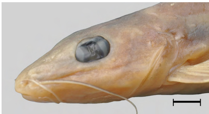
Figure 8. Rhamdella longiuscula , MLP 10902 (112.5 mm SL), detail of branquial membrane. Scale bar = 5 mm.