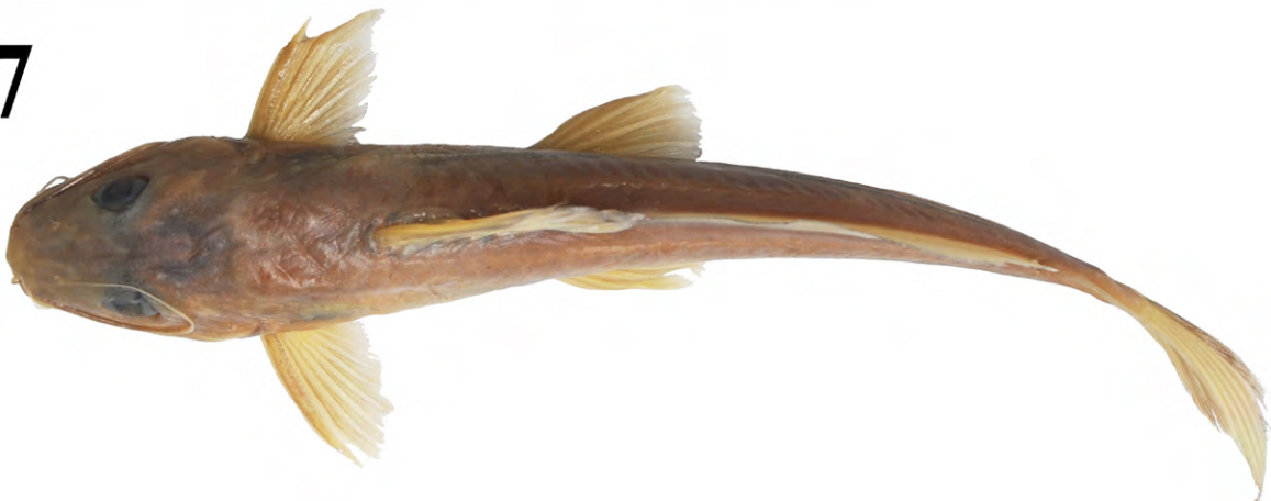
Figures 6 and 7. Rhamdella longiuscula . 6: MLP 10902 (112.5 mm SL), lateral view. 7: MLP 10903 (60.7 mm SL), dorsal view.