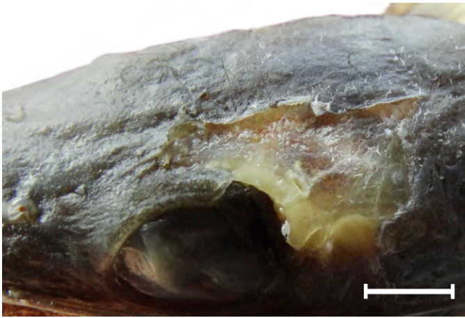
Figure 4: Rhamdella cainguae , LGE-P 47 (118.17 mm SL), detail of the large ovoid and well differentiated area between the frontal and sphenotic bones. Scale bar = 5 mm.