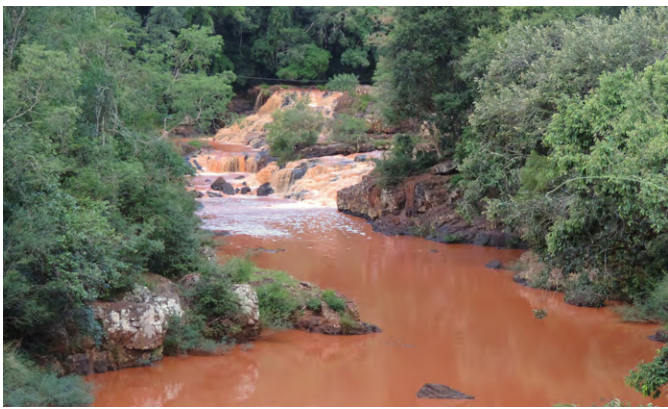
Figure 5: Tabay stream, Jardín América, Misiones, Argentina.

17.9–20.3% HL vs. 31.0–44.9 and 12.8–17.7 respectively. The specimens considered herein were collected from Tabay (Figure 5) and Horqueta streams, Paraná River basin in Misiones province, Argentina.