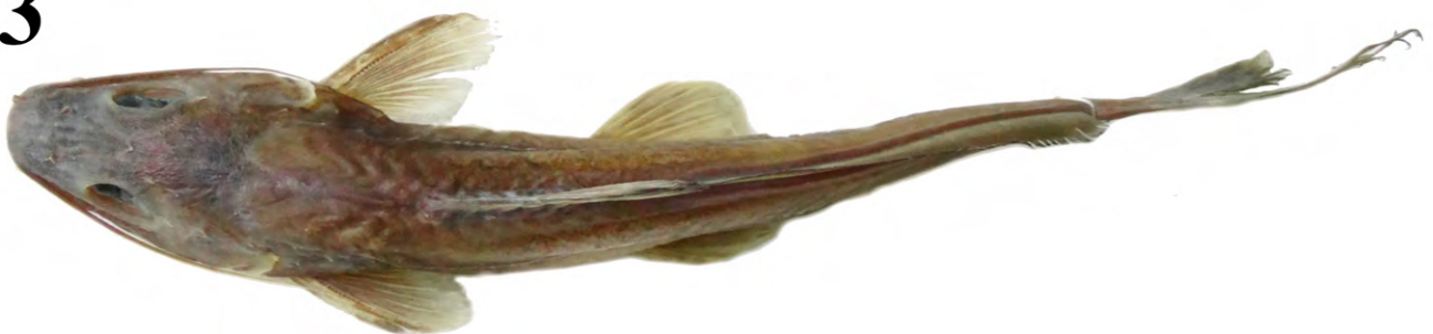
Figures 2 and 3. Rhamdella cainguae . 2: LGE-P 47 (118.17 mm SL), lateral view. 3: LGE-P 46 (105.44 mm SL), dorsal view.