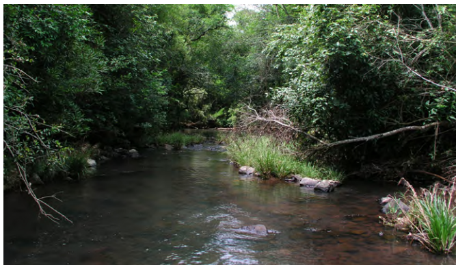
Figure 9. Shangay stream, Colonia Tres Bocas, Departamento 25 de Mayo, Misiones, Argentina.