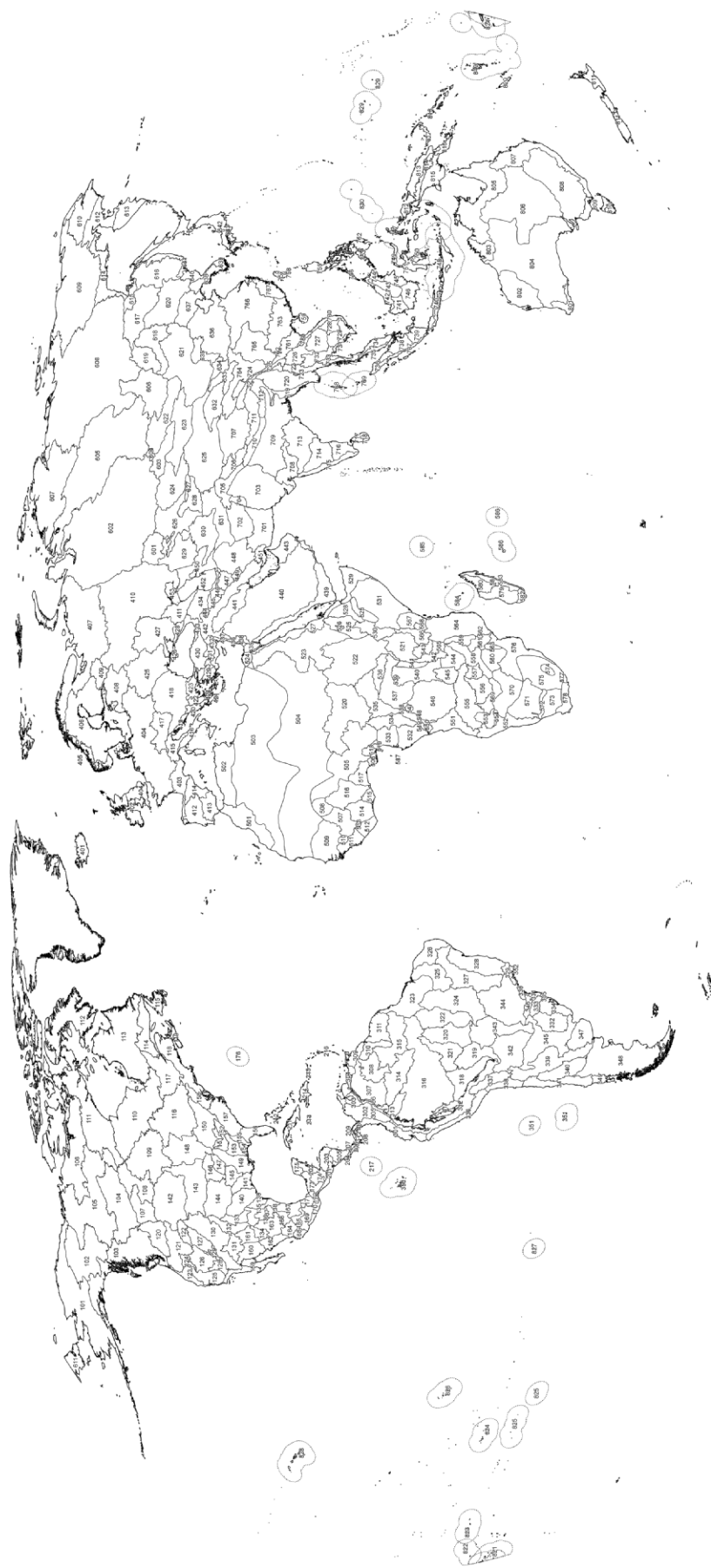
Figure 1. Map of freshwater ecoregions of the world, in which 426 ecoregions are delineated. An interactive version of this map that includes additional information is available at www.feoww.org .