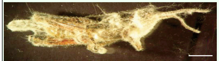
Figure 3. Fusarium verticillioides on third-instar nymphs of Ronderosia bergi 48 h after death. Scale bar: 14 mm. High quality figures are available online.

The means by which the infection of T. collaris and R. bergi by F. verticillioides might have been effected is not clear, but Kilpatrick (1961) stated that the entry of the fungus into the insect could occur via the oral route, oviposition tubes or wounds.