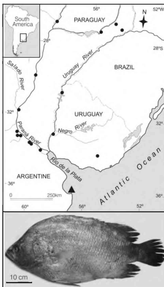
Fig. 1. ▲ First record of Oreochromis niloticus in the Samborombón Bay (36° 17' S - W 36° 46'), ● aquaculture fisheries of O. niloticus in the Paranoplatense Basin.

The specimens caught measured 600, 580, 450 and 290 mm in total length and 4,900, 4,010, 2,350