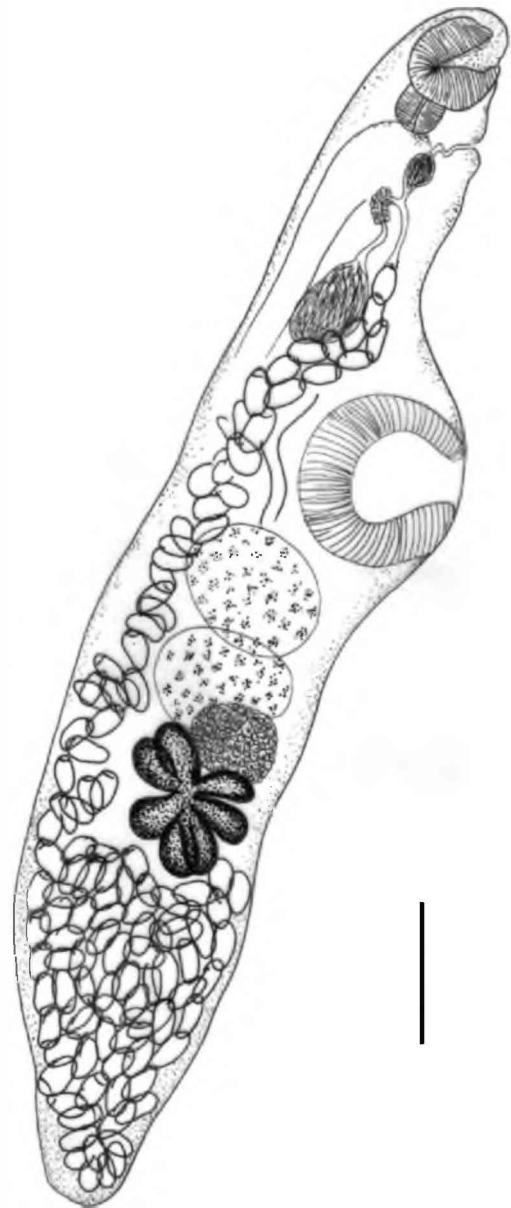
Fig. 3. Aponurus laguncula (schematic, in toto ). Scale bar = 0.1 mm

Site of infection: Stomach. Voucher specimens: MLP 5938. Prevalence of infection: 19.80%. Mean intensity: 2.