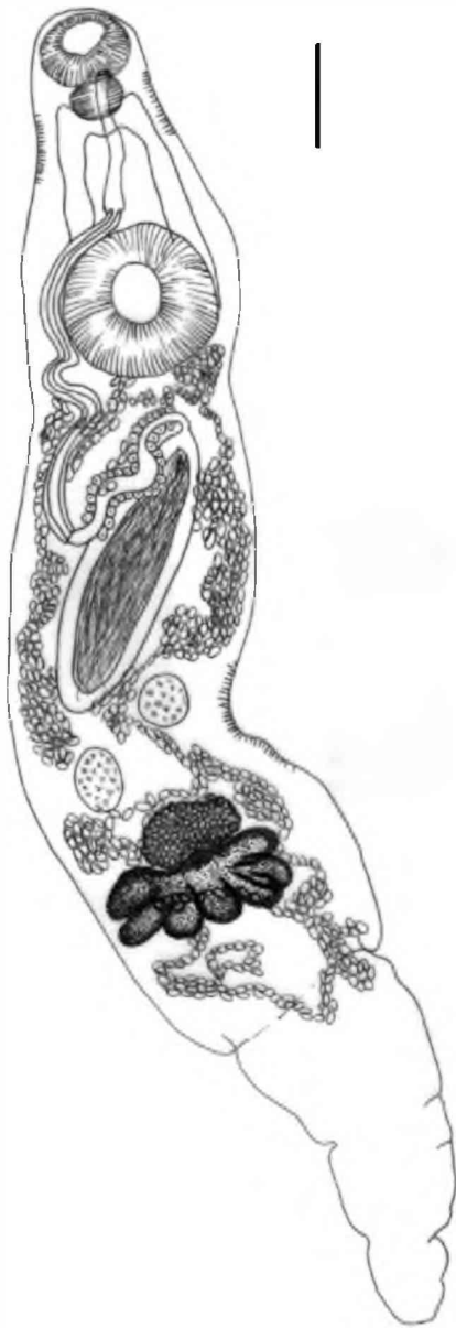
Fig. 2. Elytrophalloides oatesi (schematic, in toto ). Scale bar = 0.2 mm

E. oatesi has also been cited in approximately 11 fish species from waters adjacent to the Malvinas (= Falkland) Islands (Zdzitowiecki 1997, Kohn et al. 2007). Our research reports the first citation of E. oatesi in Silver warehou, S. porosa .