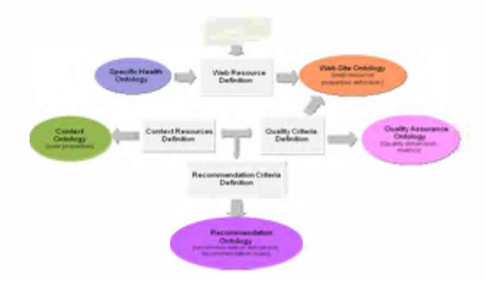
Fig. 2. Salus recommender start-up

will be identified in the recommendation criteria definition. Mainly, they are: the user properties and the query resources . The user properties are those that were already relieved at the recommendation criteria definition task and will be populated at the moment of registering a user at the recommender system: For instance, if at the recommendation criteria definition was specified the user property belongs , when she is registered to the system, this property is instanciated between Paul and 12-20 range . The query resources refers to query attributes like query goal .