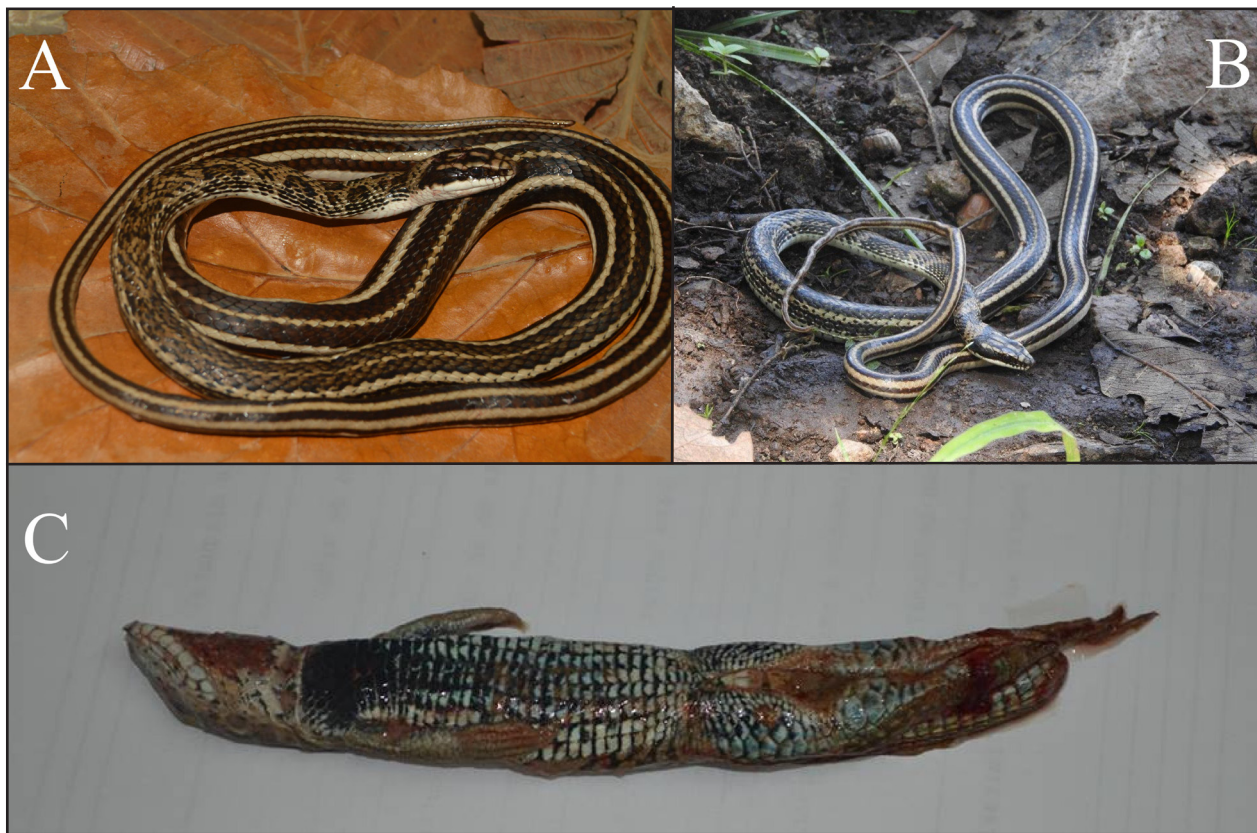
Figure 1. A) An adult female Salvadora mexicana from San Juan Capistrano, Municipality of Valparaiso, Zacatecas (SDSNH_HerpPC_05366). B) An adult specimen of Salvadora mexicana from San Miguel Huaixtita, Municipality of Mezquitic, Jalisco (SDSNH_HerpPC_05365). C) An adult male Aspidocelis gularis scalaris that was consumed by Salvadora mexicana from San Juan Capistrano, Municipality of Valparaiso, Zacatecas.