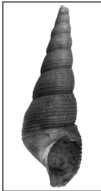
Figure 2. Melanoides tuberculatus (Müller, 1774) from Iguazú National Park, Argentina: shell of an adult specimen (20.05 mm length).

The material collected (MLP N° 12576) is the shell of an adult specimen (figure 2), 20.5 mm in total length. The coloration is uniformly brownish without evident bands, similar to that of specimens recorded in Rio de Janeiro, Brazil (MLP N° 12574). Fifteen juvenile specimens, 1.33 \text{ mm} \pm 0.41 in total length (figure 3), were also collected at the same site; these were scattered on the basaltic substrate. Although the determination of juvenile specimens is not easy, in this case their size was much smaller than that of the native thiarid species ( Aylacostoma spp.), whose minimum size at birth is between 7 and 8 mm (Castellanos, 1981). In contrast, the young M. tuberculatus are between 2.4 and 3 mm at birth (Quintana et al. , 2001-2002), much more similar to the dimensions recorded for our materials.