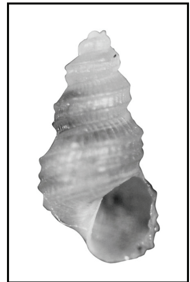
Figure 3. Melanoides tuberculatus (Müller, 1774) from Iguazú National Park, Argentina: shell of a juvenile specimen (2.18 mm length).

approximately 300 km away, one of them, upstream, to the NE of the new site, in Paraná state, Brazil (Londrina, Sertajena and Sertanópolis), and the other, downstream, to the SW, in Posadas, Argentina. Some populations have also been recorded in Santa Catarina State, Brazil, in environments that are not part of the Iguazú basin, but are close to the headwaters of this river. However, no specimens of M. tuberculatus were recorded in our samplings on the Upper Iguazú River. It is noteworthy that nine hydroelectric dams have been built on the upper course of Iguazú River in Brazilian territory whose reservoirs are exploited for aquaculture and aquarism. These types of artificial environments favour the colonization of opportunistic species, as the case of M. tuberculatus in Posadas. Pointier et al. (1993) and Rocha Miranda & Martins Silva (2006) mentioned that the populations of M. tuberculatus occurred mainly in backwaters and shady areas with fine sediment (organic detritus). However, as it was noted in this work and by Giovanelli et al. (2005) this