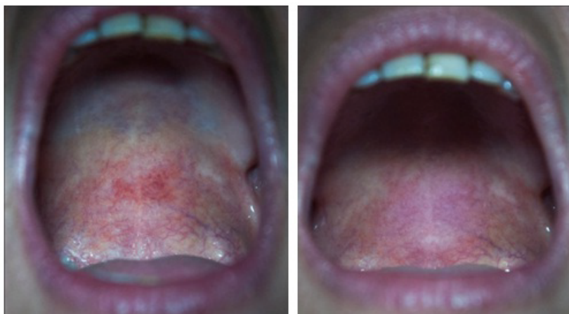
Figure 3. Oral optical biopsy