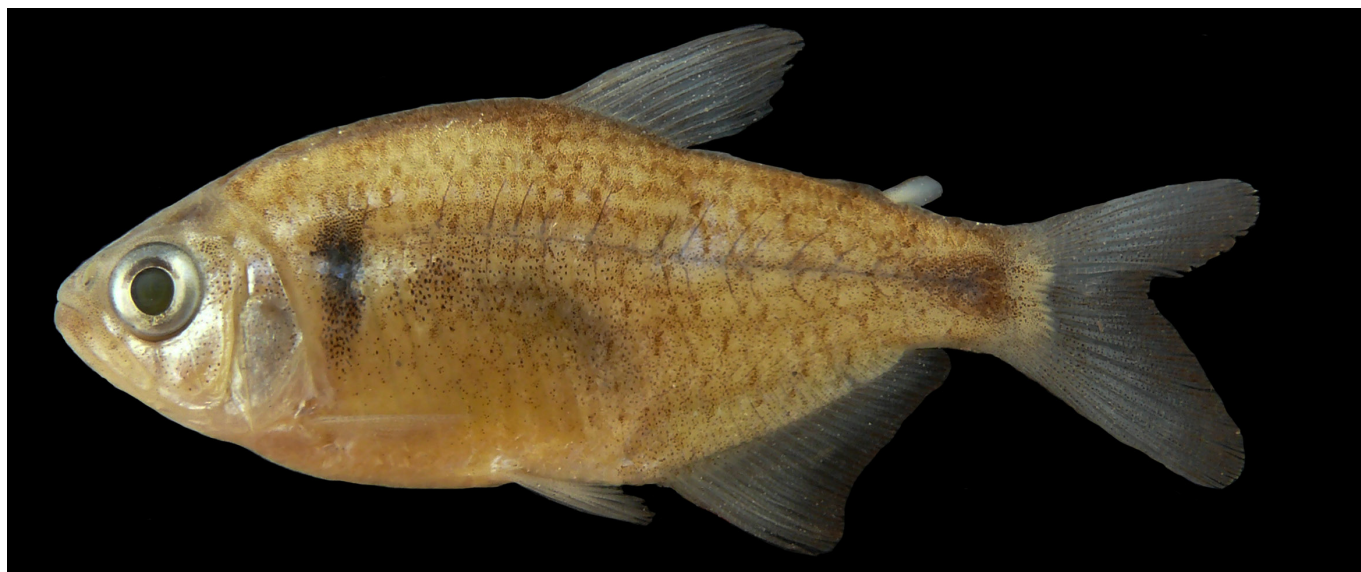
FIGURE 1. Ectrepopterus uruguayensis , ILPLA 1817, female, 44.6 mm SL, El Molino Creek, Entre Ríos Province, Argentina.

Fowler (1943) described Megalamphodus ( Ectrepopterus ) uruguayensis (= E. uruguayensis ) from Uruguay, providing no further locality data. Ever since, few specimens or records for species has been cited in the literature (Géry 1972; Géry 1977; Weitzman and Palmer 1997; Thomaz et al. 2010), until to redescription and