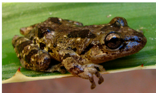
FIGURE 2. Individual collected on January 2 nd 2010 in General Villegas, Buenos Aires.

We had obtained two previous records, but in neither of them we could obtain physical evidence. On December 17 th 2009 one individual was heard in a temporary pond located at 4.5 km from the area mentioned above. This pond also had some exotic vegetation around. Lately, on February 12 th 2010, after heavy rains, at least two other individuals were heard at a nearby pond from the site where we collected the original individual, and also with the same physiognomy.