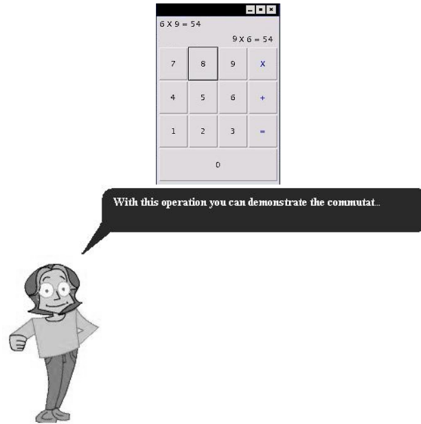
Figure 2. The APA giving an instruction.

(see Figure 2) playing the role of an animated tutor to help primary school students to learn some fundamental mathematical properties of multiplication.