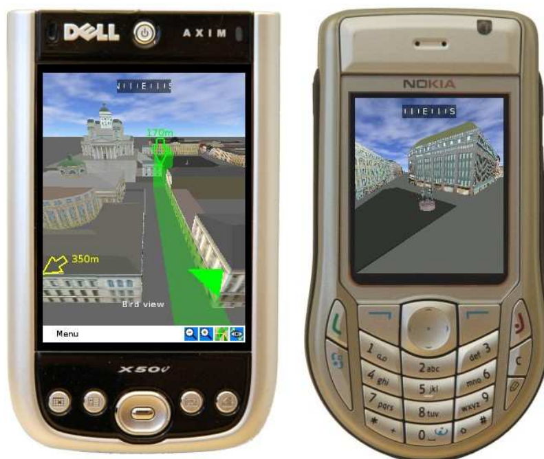
Fig. 1. mLOMA client running on Pocket PC and Symbian Series 60 platforms

mLOMA [13] (mobile LOcation aware Messaging Application) is in its essence a 3D map application optimized for mobile devices and built on top of OpenGL [9] and GLUT [6]. The mLOMA client can be used to browse a real time rendered 3D scene with a framerate acceptable for interactive use. It features a route guidance system and support for GPS location tracking. A server component is also provided. If a network connection is available, clients can receive up-to-date information on the model and interact using the server. Users can track each others' locations and communicate using messages. Messages can be public or targeted to individual users and they can be attached to any points in space or the model.