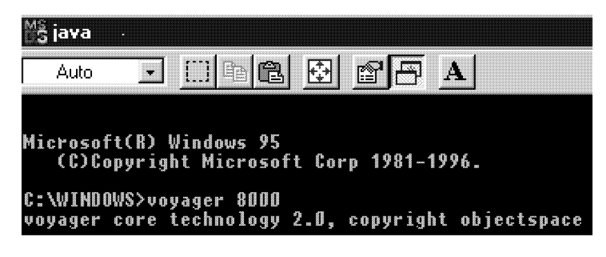
Figure 2. Execute Voyager Environment