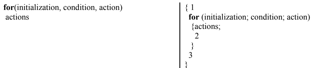
Figure 2: Insertion Scheme

not helpful. For instance, one situation where that problem can emerge is within iterations. That is the reason we need to control the number of invoked functions we want to display. In order to overcome this problem, we insert code before , within and after the iteration statement; observe Figure 2.