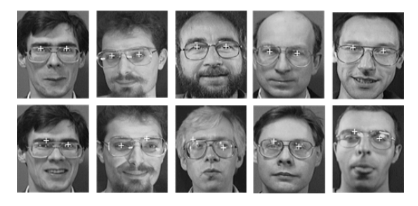
Fig. 5. Examples for faces with spectacles

We also made experiments to the faces with spectacles, but the results are very unsatisfied. Fig. 5 shows some examples of these experiments. The images in the first line are five examples for faces with spectacles for which the proposed algorithm could correctly detect the iris centers of both eyes. And the second line gives five faces for which the proposed algorithm failed the correct detection of the iris centers. After comparing and analyzing the detection results, we found out that the false detection is mainly due to the reflection of the spectacles. That is to say, the reflection of the spectacles changes the intensity values of pixels around eyes, which leads to a false template matching.