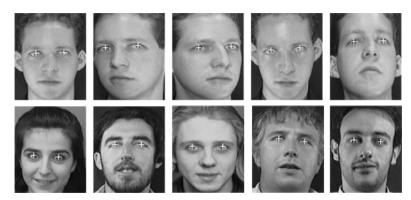
Fig. 4. Examples for faces without spectacles

We made experiments using all faces without spectacles which concerns 227 face images and 29 persons. The success rate of proposed algorithm for all 227 faces is 95.2%. Fig. 4 shows examples of the images for which the proposed algorithm could correctly detect the irises of both eyes. In the first line, there are five face views of the same person. And the images in the second line are faces of five different persons.