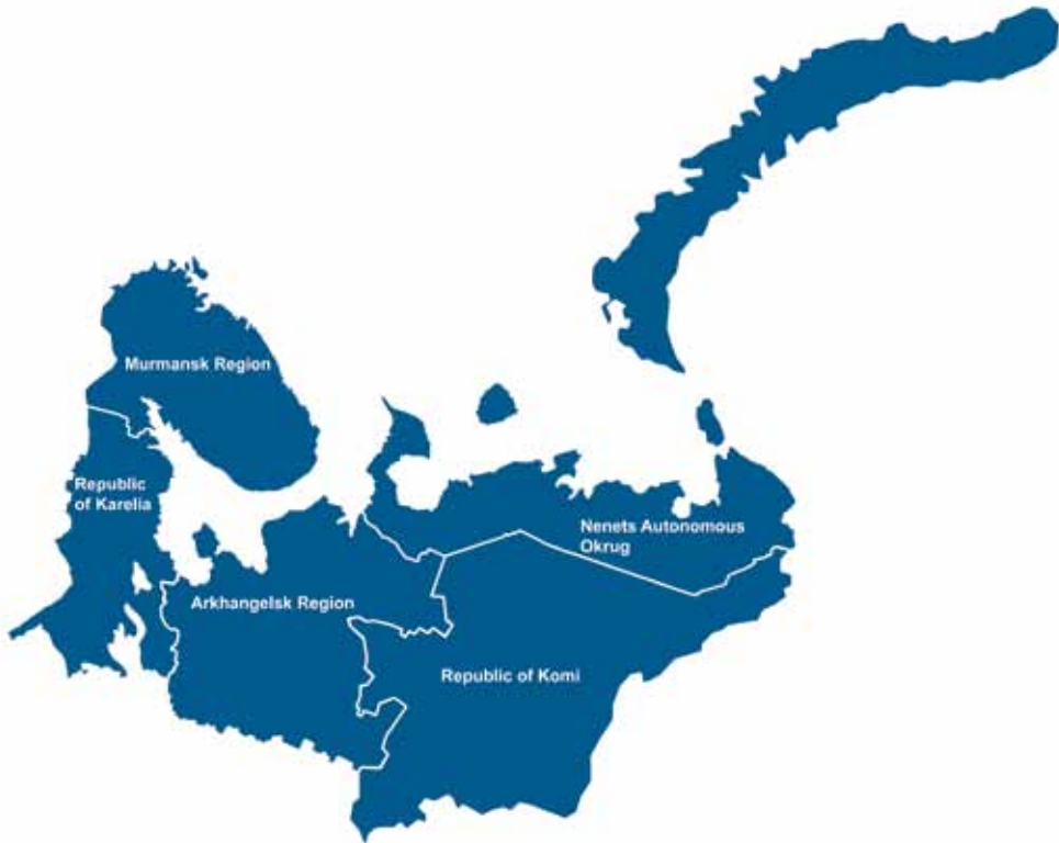
Figure 1. Map of the five regions in Northwest Russia where interviews were conducted.