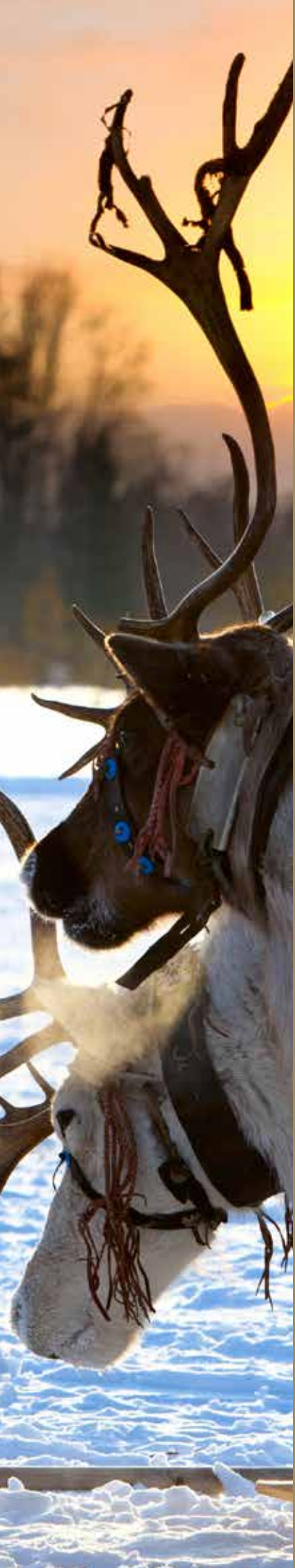
Chapter cover image: Reindeers.