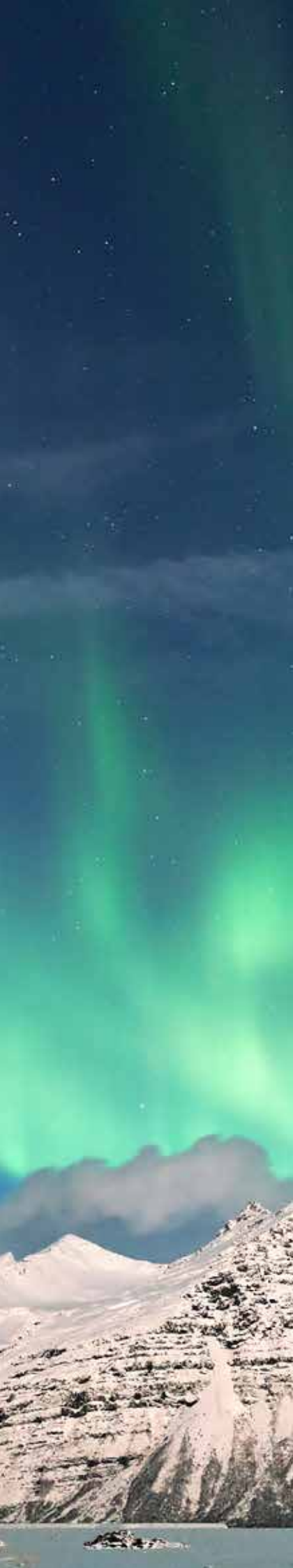
Chapter cover image: Aurora Borealis.