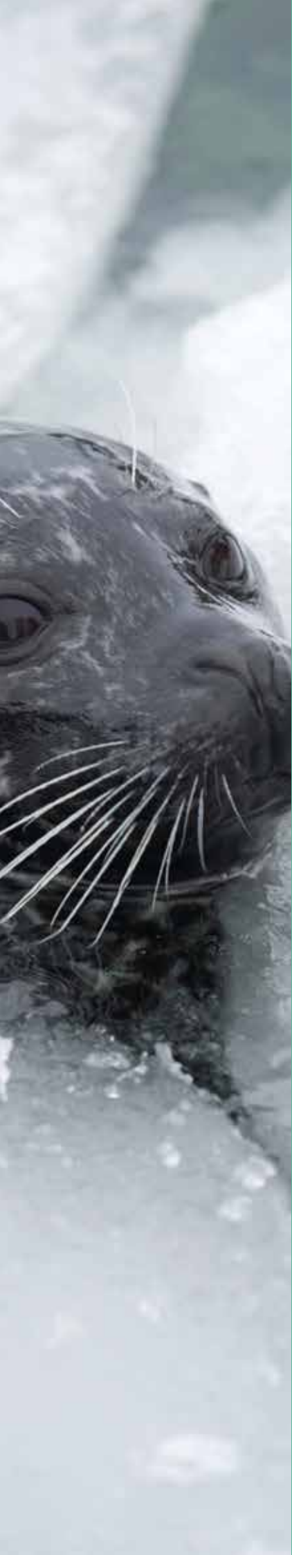
Chapter cover image: Seal.