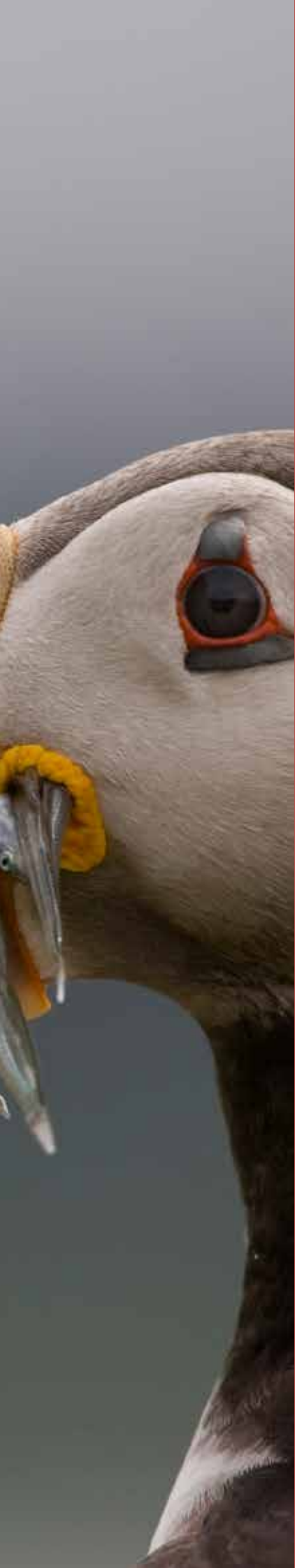
Chapter cover image: Puffin.