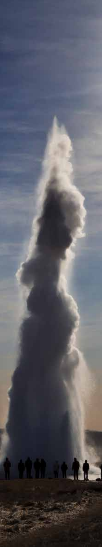
Chapter cover image: Strokkur Geysir, Iceland.