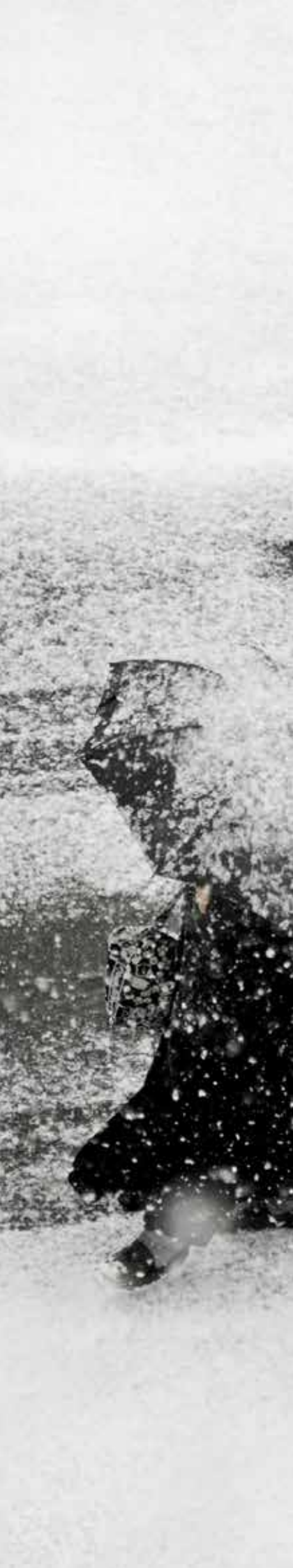
Chapter cover image: Snowstorm.