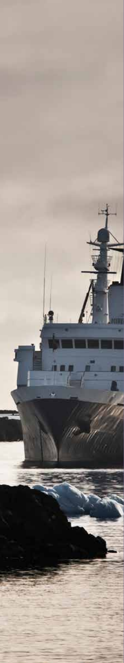
Chapter cover image: Arctic Shipping. Photo: GettyImages