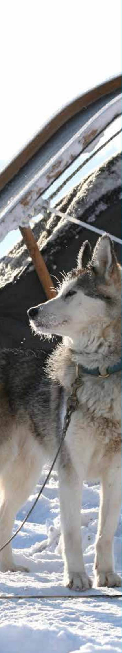
Chapter cover image: Sledge dog.