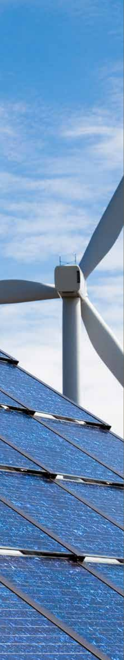
Chapter cover image: Solar panels with wind turbine in the background.