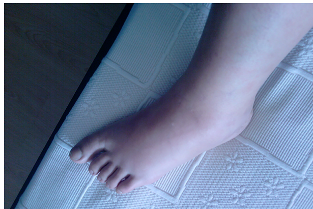
FIGURE 1: EDEMA OF THE INFERIOR MEMBER