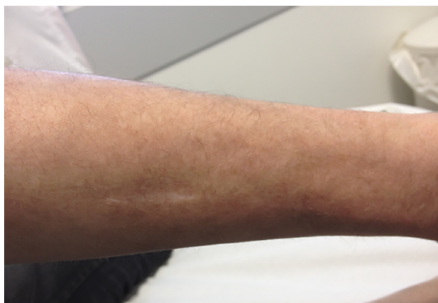
FIGURE 3: GROOVE SIGN ON THE RIGHT FOREARM