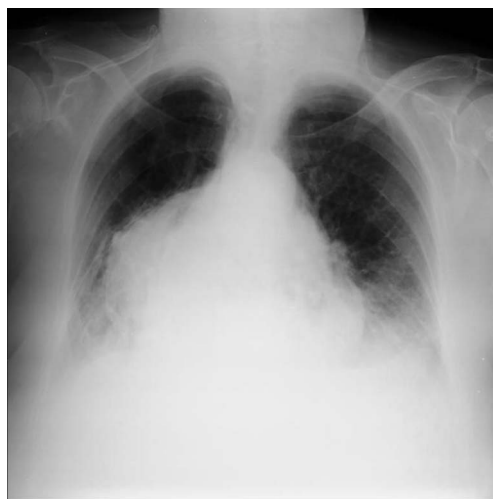
Figure 1 Chest X-ray revealing extreme enlargement of the mediastinum.

This case is relevant for the potential of a voluminous hernia to exacerbate respiratory symptoms in a patient with chronic respiratory disease in her medical history. Since this diagnosis was made in the presence of an acute exacerbation of her