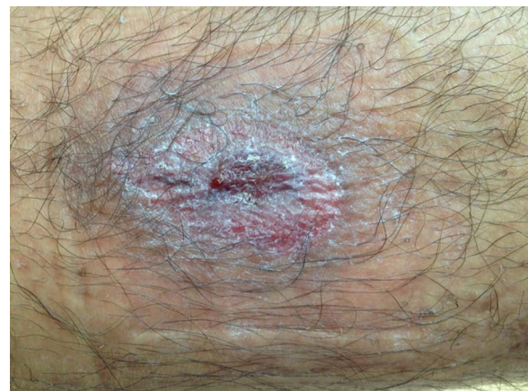
Figure 4 The ulcer, almost cured after 3 months of follow-up.