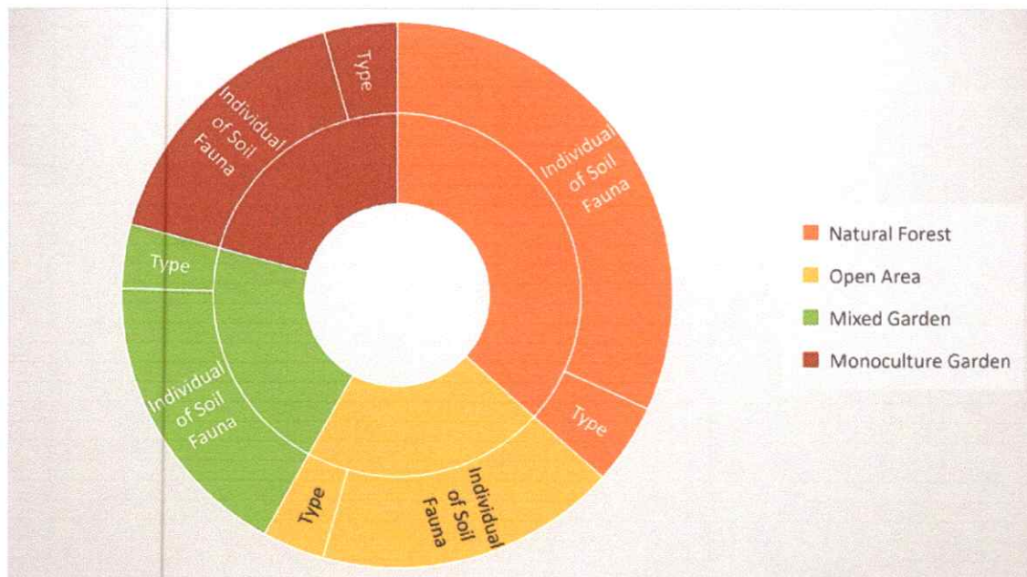
Figure 1: Functional abundance of soil fauna in several types of land in super wet tropical rain forest areas (Type and Individual functional soil fauna)

Figure 1. shows that the type of natural forest land has the highest abundance of species and functional individuals of soil fauna compared to other types of land. Furthermore, open land, mixed gardens and monoculture gardens have almost the same abundance of soil fauna. Forests as natural habitat Soil fauna is a productive place for soil fauna. According to [13] Certain regions of the world are known as centers of biodiversity, because they contain a high diversity of various levels of diversity, both the level of diversity of genes, species and ecosystems. Tropical rainforests are the peak point of biodiversity. Furthermore, according to [14] the interaction between soil fauna and its environment in tropical rainforest areas will form a mutualistic relationship in building the ecosystems of each land. [15] mentions that soil fauna groups are agents that assist in the supply of nutrient trees (symbiotic organisms) and recycling of primary production (decomposers), in which groups of soil fauna will carry out their activities alongside trees to ensure availability of nutrients. This is mainly due to the discovery of a mutualistic relationship between soil organisms, their immediate environment, and key processes such as litter decomposition, root growth, and forest dynamics.