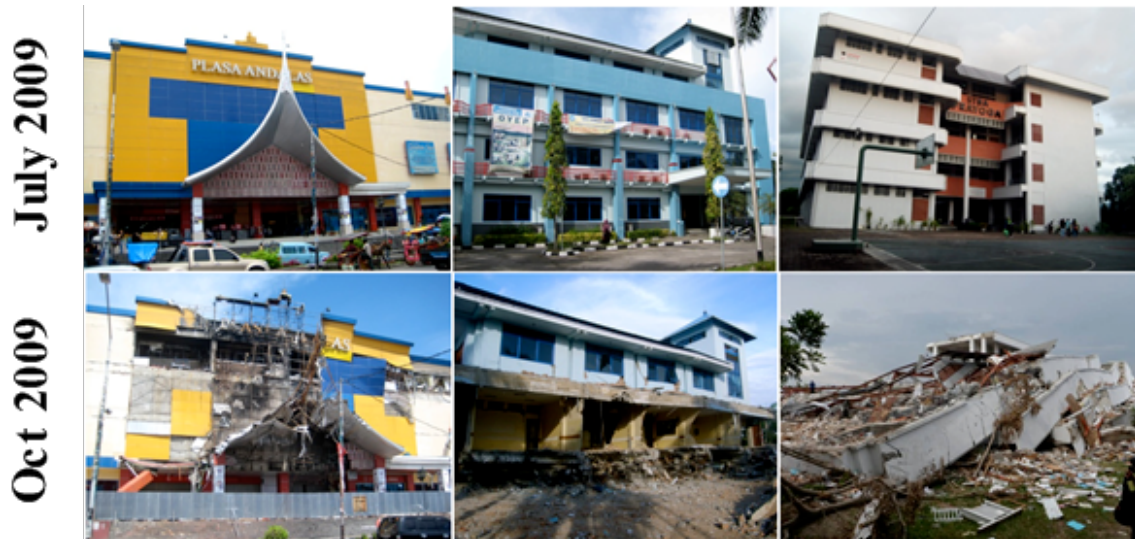
Figure 4. Before and after photos of buildings that had been recommended as evacuation sites. From left to right: Four story mall, partial collapse on the 4 th floor and fire; 4-story language school, collapse of first 2 stories; 4-story junior college, complete collapse.

Buildings that had been previously recommended as potential tsunami evacuation sites varied in performance. Many suffered heavy structural and nonstructural damage, while a few completely collapsed. This wide spectrum of performance demonstrates the need for a more thorough analysis of buildings, before any are recommended as evacuation sites. Although some of the building's structural system remained intact, nonstructural damage was so intense that most people would have felt unsafe going inside. Therefore, their use as evacuation sites remained ineffective. Of the 31 potential evacuation buildings visited by the EERI reconnaissance team, 1/3 were found to have collapsed or were heavily damaged, and roughly \frac{3}{4} of the buildings had sufficient damage still to be closed two weeks after the earthquake. Figure 4 shows before and after photos of some of these buildings.