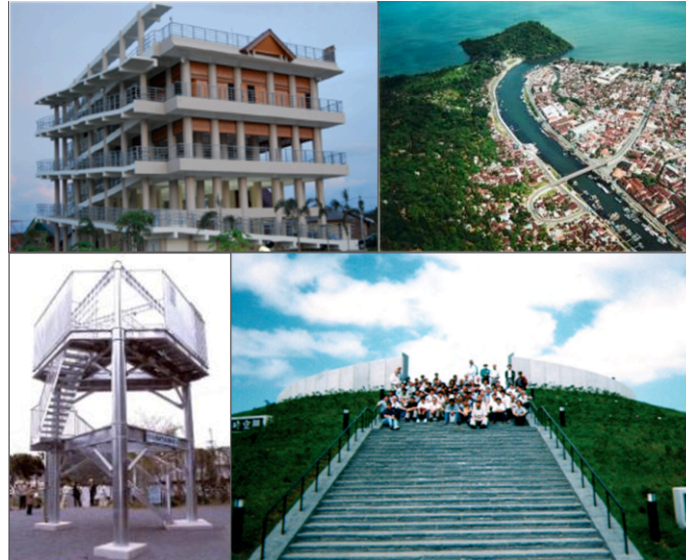
Figure 2. Examples of tsunami evacuation structures. (Top left) Tsunami evacuation building in Banda Aceh, built after the 2004 tsunami. This building’s secondary purpose is to serve as a community center. (Bottom Left) Pre-fabricated structure in Japan with the sole purpose of serving as an evacuation site during a tsunami. (Top right) Aerial photo of a bridge in Padang that provides access to high ground from the city center. (Bottom Right) A soil berm in Japan that provides refuge during tsunamis.