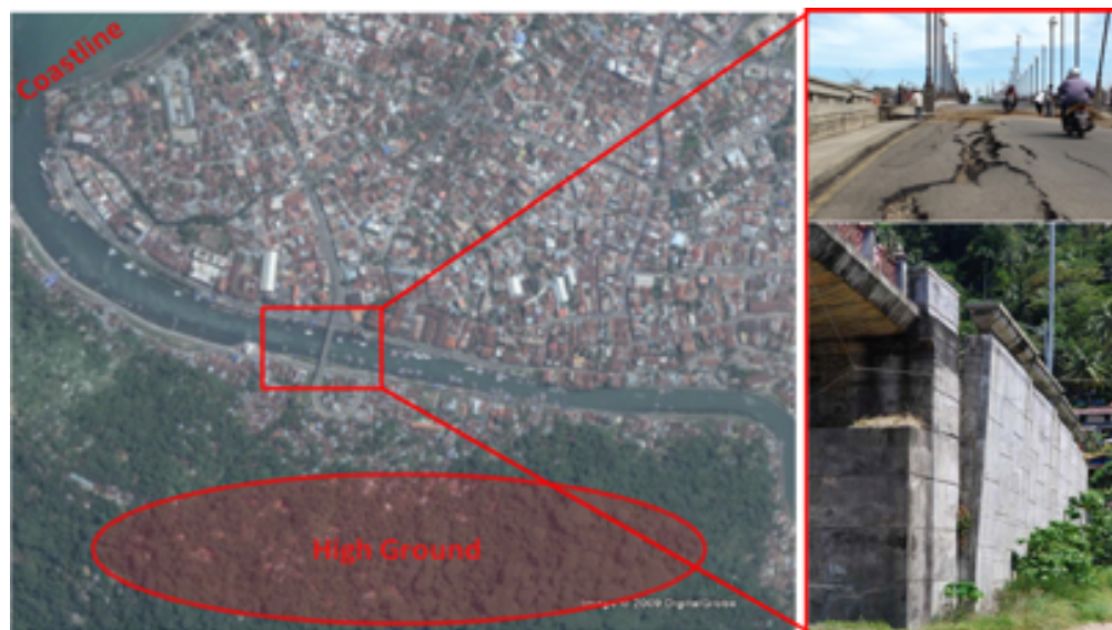
Figure 3. (Left) Map indicating location of one of the major bridges connecting the dense city

The roads and bridges leading to “safe ground” (either inland or to high ground) did not suffer heavy damage, but the already narrow roads became even more constricted, due to building debris. A recent study by Professor Febrin from Andalas University showed that the evacuation demand on these roads is too high, even if the roads are clear of debris. One of the major bridges connecting part of the dense area of the city to high ground did suffer some damage. As can be seen in Figure 3, the damage is in the approach to the bridge and not to the bridge structure itself. Although this bridge will need substantial repair, the damage was not sufficient to have presented major problems with evacuation, had a tsunami occurred.