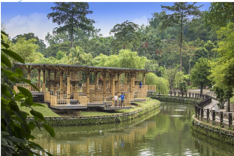
Fig. 13 Bamboo Playhouse (Eleena Jamil Architect)

Bamboo flourishes in Malaysia where it has almost 50 species growing, of which 25 is indigenous. There are several species that have thick culm walls with strengths suitable to use in construction. The Bamboo Playhouse is a public pavilion located at Perdana Botanical Gardens, Kuala Lumpur. The pavilion is located on a small island in the lake and is used by many as a place to meet, rest and play. The project demonstrate that bamboo is a sustainable building material, and it became first formal bamboo structure in the country when it was completed in 2015 (Architect).