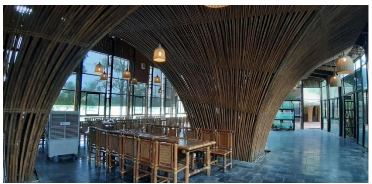
Fig. 2 Roc Von Restaurant in Hanoi

Another example of VTN Architects's bamboo design – the curving Roc Von restaurant is formed of 12 huge bamboo columns that spread upwards, creating a canopy that covers a 6,560 square meter semi-outdoor dining area. This building, located on a 1,100 square meter area was completed in April 2015 and is deemed and recognised as a space where local and global visitors can feel a strong connection to the local culture of North Vietnam. The open quality of the space and usage of natural materials including bamboo had helped create this connection.