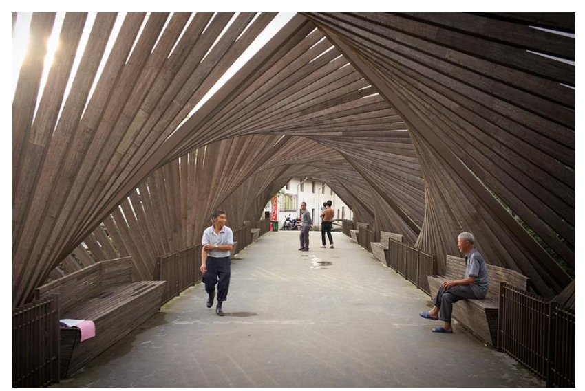
Fig. 10 Bridge by Ge Quantao