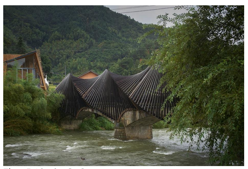
Fig. 6 Bridge by Ge Quantao