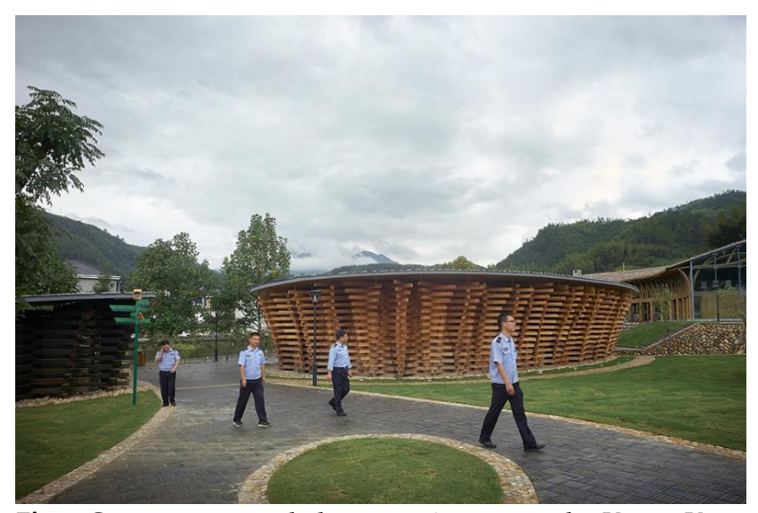
Fig. 7 Contemporary celadon ceramic museum by Kengo Kuma