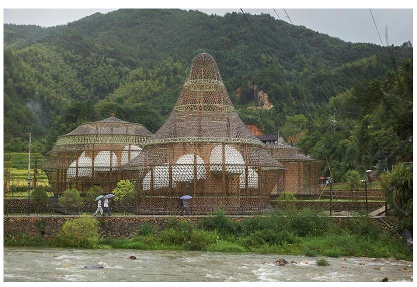
Fig. 5 Youth Hostel / Design Hotel by Anna Heringer

The first International Bamboo Architecture biennale was in 2016. Curated by 12 international architects, the biennale reveals how the traditional material can be incorporated into contemporary design. The plant serves as the base to new buildings in the small village of Baoxi - including a youth hostel and a ceramics museum, which the permanent structures hopes to draw tourism through supplementary infrastructures such as a visitor building, hotel, and learning centre.