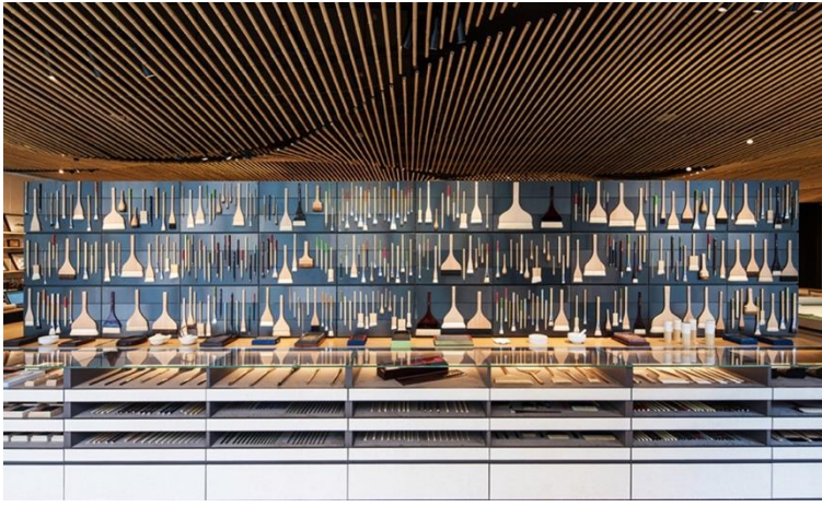
Fig. 4 Interior view with the traditional Japanese products

The 'Pigment' shop and gallery is made up of a very thin bamboo material that gave the wavy shape of interior. The design created a smooth surface that is detailed with the traditional products inside. The whole surface of the interior covered by wood material. One of the aims of this project was to form a 3D curved surface in a frame of concrete, generated from computer technology. Laser-cut steel panels and thin bamboo are the basic materials to be used inside. A wave of bamboo for the shop is created, a purpose-built space to show and sell traditional pigment for Japanese painting, along with brushes and old inkstone.