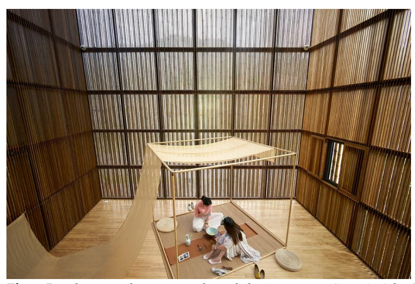
Fig. 9 Bamboo product research and design center (interior) by Li Xiaodong