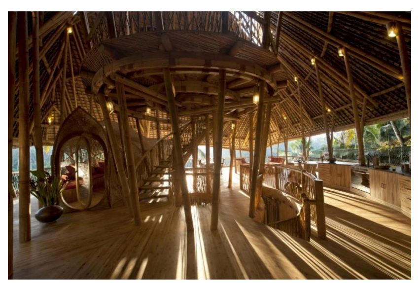
Fig. 13 The Bamboo houses are designed with rare views of the sacred Ayung River and the volcanoes of Bali (<u>Ibuku Architects, Source Image: Jimbawan, Agung Dwi, Rio Helmi</u>)

According to the architect Elora Hardy, the Green Village was designed and constructed based on the architectural concepts of sustainable principles and artisan craftsmanship. Green School, PT Bamboo Pure, and Green Village are the main anchors of the green development area. The concept is to create beautiful living spaces, in which people can live where luxury and comfort fit into natural landscapes. Interconnected with each other on a green zone which sustain themselves.