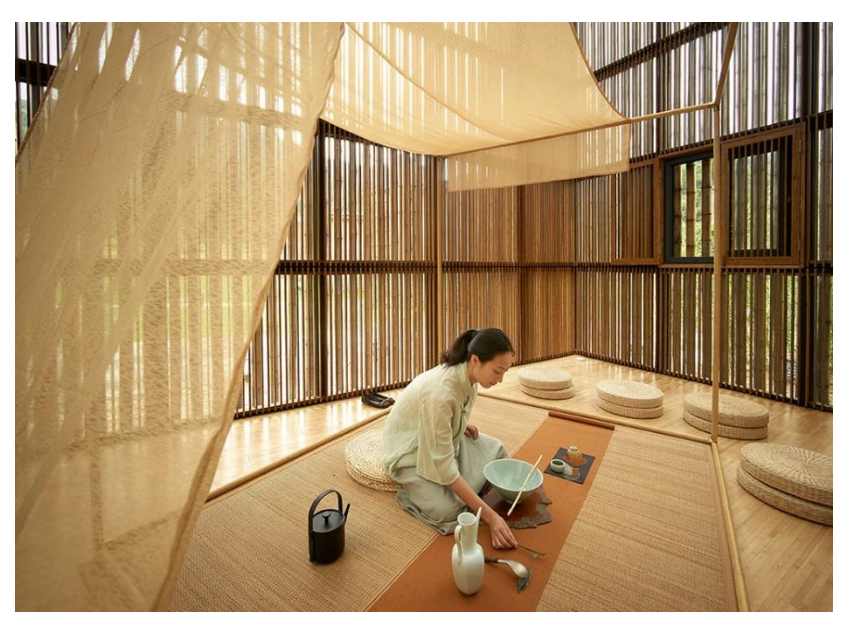
Fig. 6 Bamboo product research and design center (interior) by Li Xiaodong