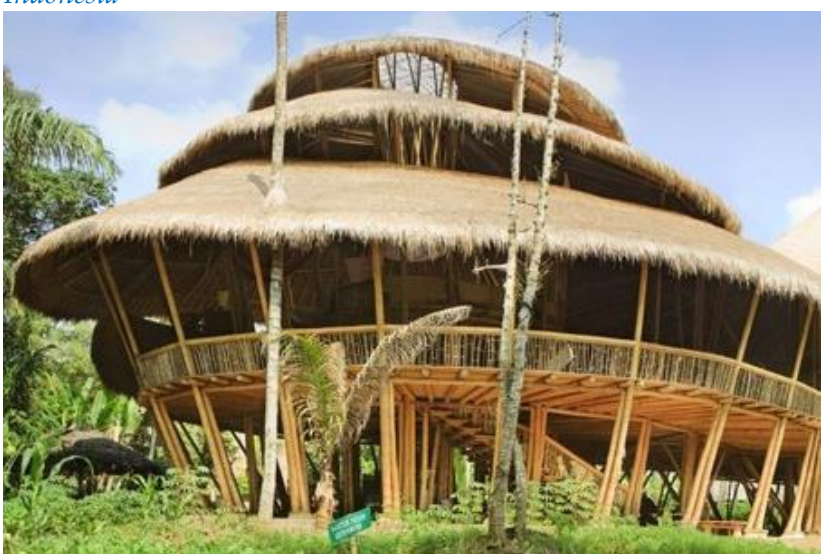
Fig. 12 The Green Village built in 2010 by Elora Hardy (Ibuku Architects)

According to the architect Elora Hardy, the Green Village was designed and constructed based on the architectural concepts of sustainable principles and artisan craftsmanship. Green School, PT Bamboo Pure, and Green Village are the main anchors of the green development area. The concept is to create beautiful living spaces, in which people can live where luxury and comfort fit into natural landscapes. Interconnected with each other on a green zone which sustain themselves.