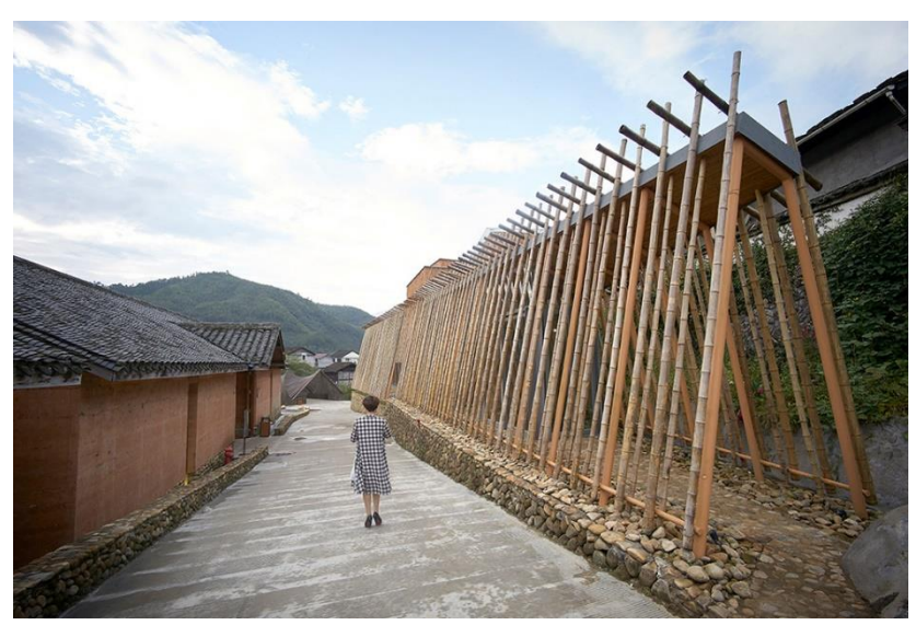
Fig. 11 Invited ceramist workshop by Keisuke Maeda