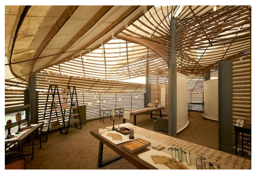
Fig. 8 Interior view of celadon ceramic museum