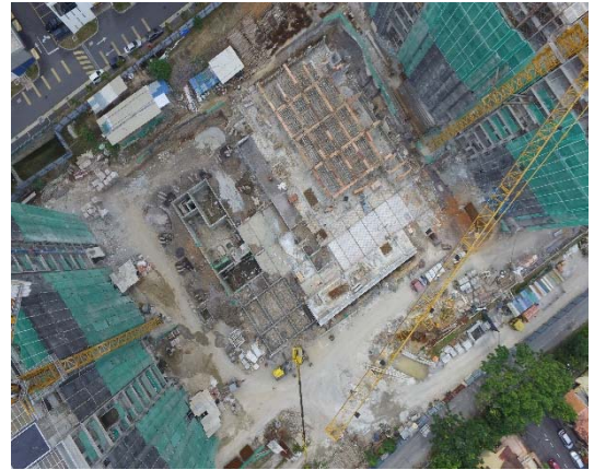
Figure 6. Site Inspection