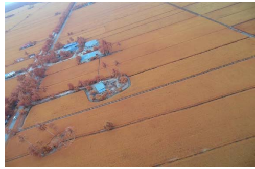
Figure 5. Precision Agriculture [13]

Here, the aerial imageries can be seen as 2D images having high spatial resolution obtained using a camera(s) attached to the drones (gimbal). Depending on the sensors and cameras used, the number of bands in the images can also vary and this determines the specific applications of the data acquired. For instance, cameras used for adventure photography purposes might only have bands of red, green, and blue, whereas, cameras for precision agricultural (Figure 5) and site inspection (Figure 6) purposes, might include additional near-infrared and thermal bands respectively.