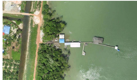
Figure 8. Potential use for flood monitoring

The applicability of drones in events of natural disaster crisis has been evaluated by [3] and [15] proclaimed the potential of drones for safety and security verification tasks. Areas of mining and construction too have found applications of drones very useful, mainly as in this case the safety of their employee is not compromised [7]. Drones have been used to advance the sustainable development goals (SDG) in a variety of creative ways for example in urban planning and management where most of the operations revolves around aerial mapping, survey and modeling features made possible using drones and software technologies. Drones have been modified to acquire LiDAR and Synthetic Aperture Radar (SAR) data as well, thereby pushing boundaries of remote sensing research [25]. [30] developed a low-cost Unmanned Aerial Vehicle-Light Detecting and Ranging (UAV-LiDAR) system to produce 3D point clouds and reported elevated spatial accuracy while performing forest inventory operations.