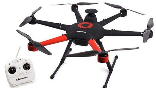
Figure 2. Hexcopter Drone [4]

On the other hand, fixed-wing drones (Figure 3) exhibit long endurance and can cover a large area with fast flight speed. In the case, the constraints fall on the expenses regarding equipment, ample amount of space required for take-off and landing, and the difficulty in flying – which requires proper training. This results in their applications to sway more to the commercial sides, and hence, rotary-drones show a higher presence in the non-commercial sectors. More recently, hybrid drones, which merges the benefits of fixed-wing UAVs with the ability to hover, have also started entering the drone markets; these drones can take off and land vertically [5]. Irrespective of