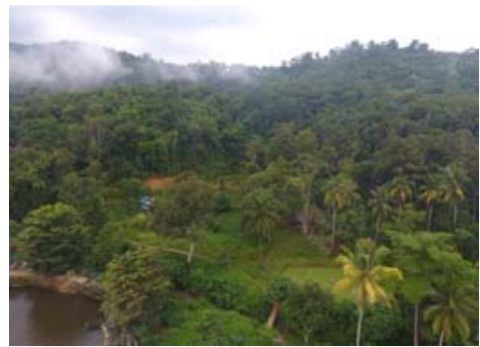
Figure 7. Forestry purpose [14][22][28]

Applications of drones have been on a boom in the last couple of years – finding new strongholds from place to place and time to time. They are increasingly playing a salient role in our day-to-day life by creating new possibilities in all sorts of area. Among these, major areas include precision agriculture, forestry [28] (Figure 7), construction and survey, disaster (Figure 8) and humanitarian relief, anti-poaching, security and surveillance and education. By using drones having multi-spectral cameras, plant growers are able to derive environmental indicators such as Normalized difference vegetation index (NDVI) for assessing plant health [20]. Recently drones have been used for planting trees as well, where the tree planting pace was found to be 10 times faster than that of human labor; this in a way allows us to save time along with offer us an alternative to fight deforestation briskly [29].