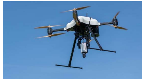
Figure 1. Quadcopter Drone

Drones can be classified into multiple categories depending on their functions, size, weight, number of propellers, aerodynamic flight principles, range, equipment, cameras used and so on. Considering the operations accompanied to the urban planning sector, the prominent types of drones are rotary-wing and fixed-wing drones, where the classification is based on the differences in their aerodynamic flight principles [17]. The rotary-wing motors are more common, as they offer high accessibility, ease of use, good camera control, ability to function in confined spaces and supports hover and vertical take-off and landing (VTOL); cost-wise also these are very affordable options. Depending on the rotor configurations, the rotary-wing drones can be further classified into tricopters, quadcopters (Figure 1), hexacopters (Figure 2), etc. However, all these drones have limited flight time (of not more than 30 minutes; [4] and small payload capacity (mostly below 8 kg; [19]). Below show a few examples of drones.