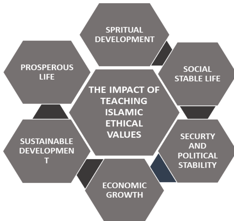
Figure 2: The Framework Showing the Impact of Teaching Islamic Ethical Values on Spiritual Development as A Major Source of Social, Political Stabilities, Economic Growth, Sustainable and Prosperous Life