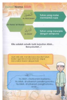
Figure. 3: The topic relates the attributes of Allah as a foundation in understanding the reality that He is the real Creator of al-makhluk .

The topic explains two attributes of Allah with regard to His ability to create the creatures in the best manner including His attributes as a Shaper ( al-mu'awwir ) and The Initiator/ Revolver ( al-b'eri ). Apart from explaining the aqidah part, it also include a du'a for every Muslims to practice it for the purpose of gaining a healthy body to perform worship to Allah.